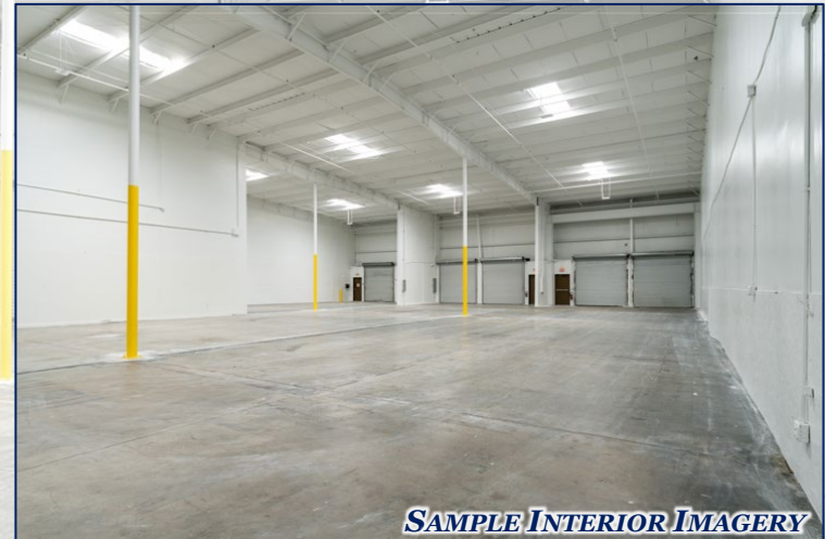
SAMPLE INTERIOR IMAGERY