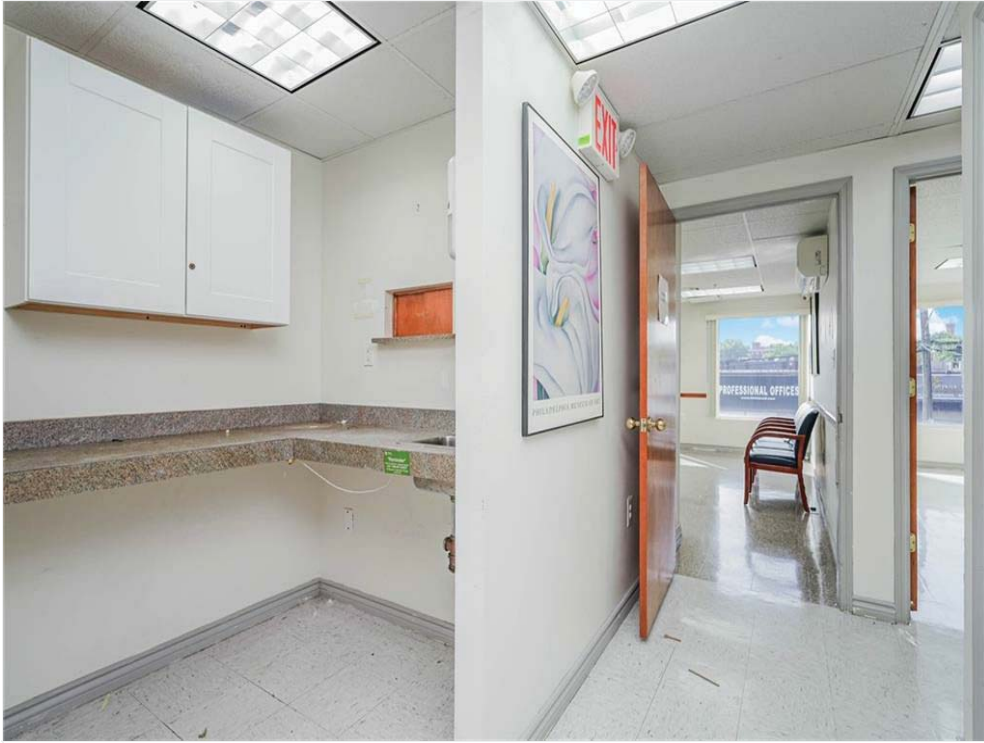
View from Hallway that leads to Patient Waiting Area