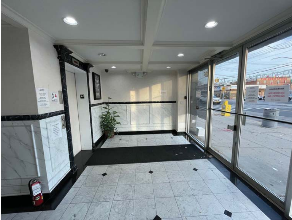
3041 Entrance Lobby