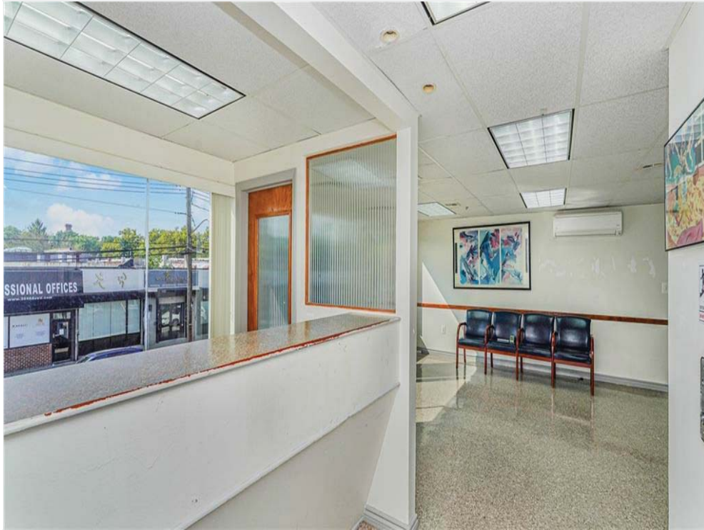
Reception / Patient Waiting Area