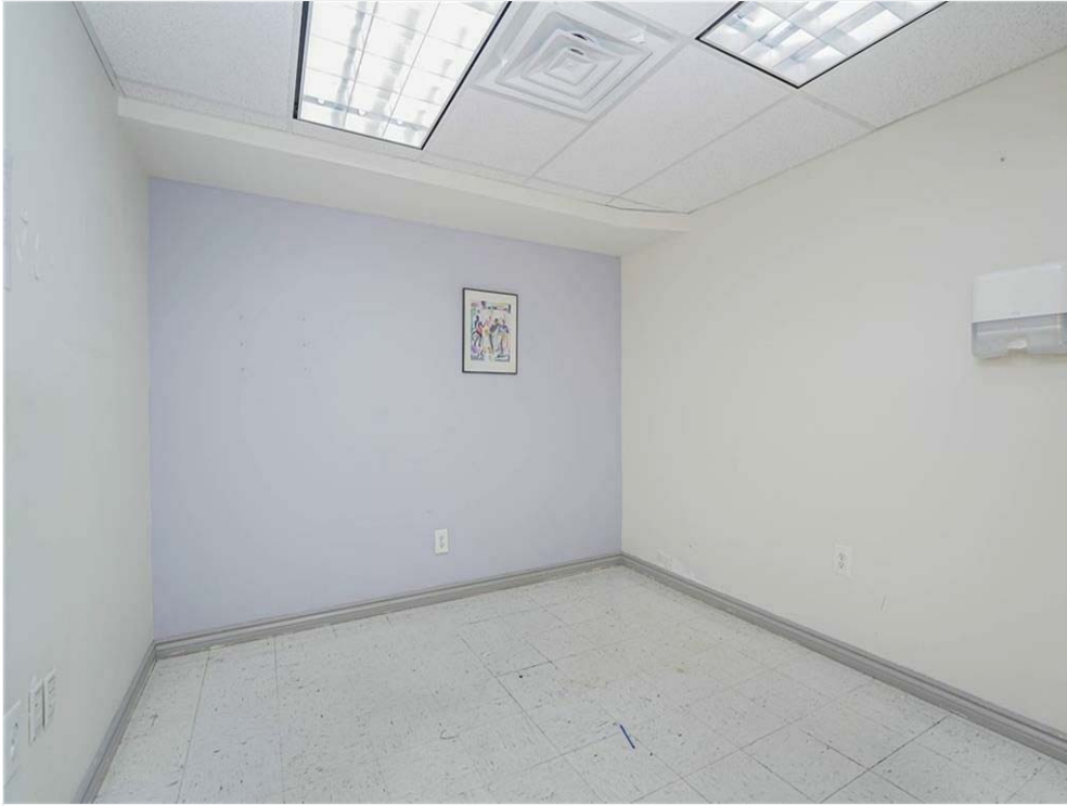
Office / Patient Room