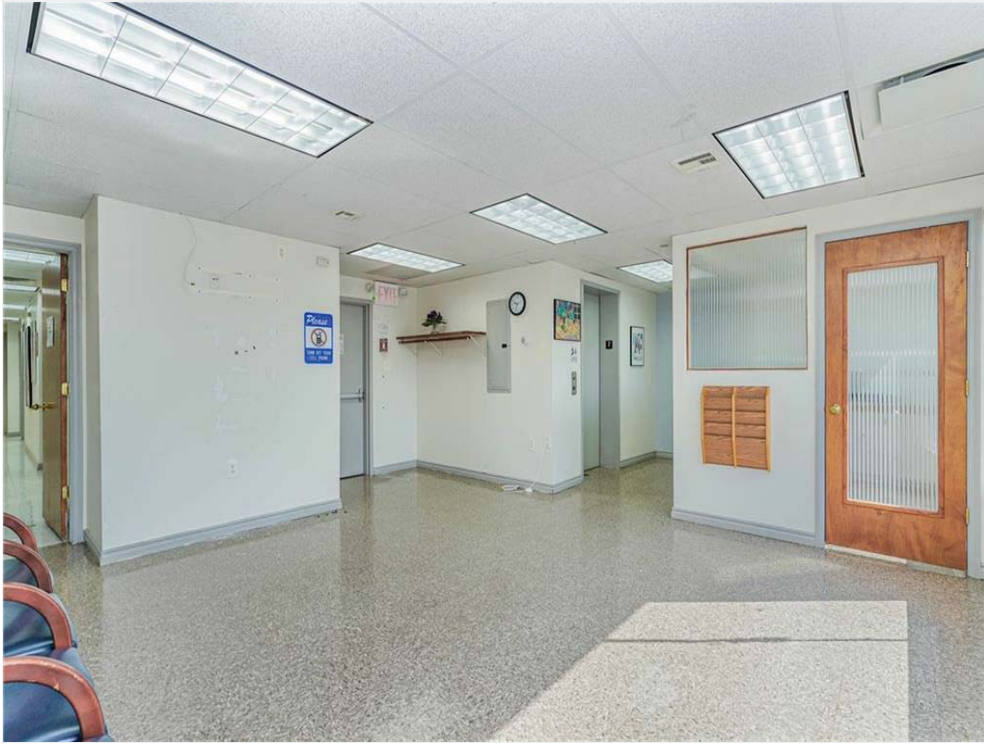
Reception / Entrance Waiting Area