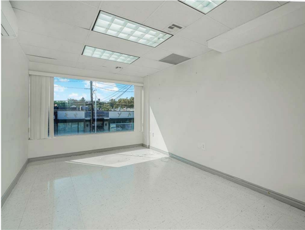
Office / Patient Room