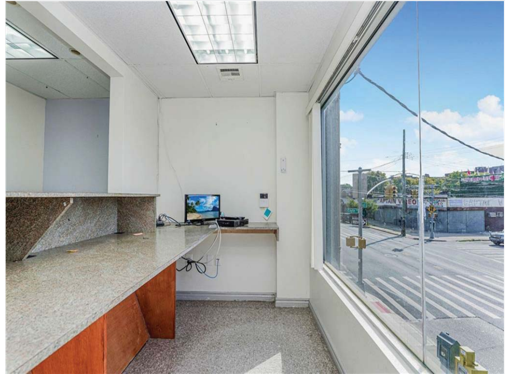
Front Desk Reception Area