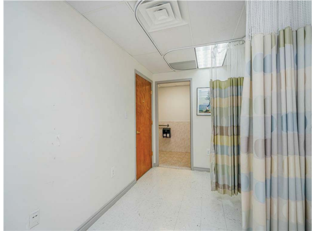
Office / Patient Room