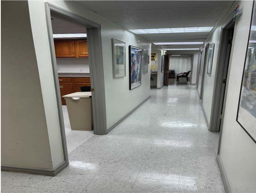
View of Hallway leading to Patient Rooms