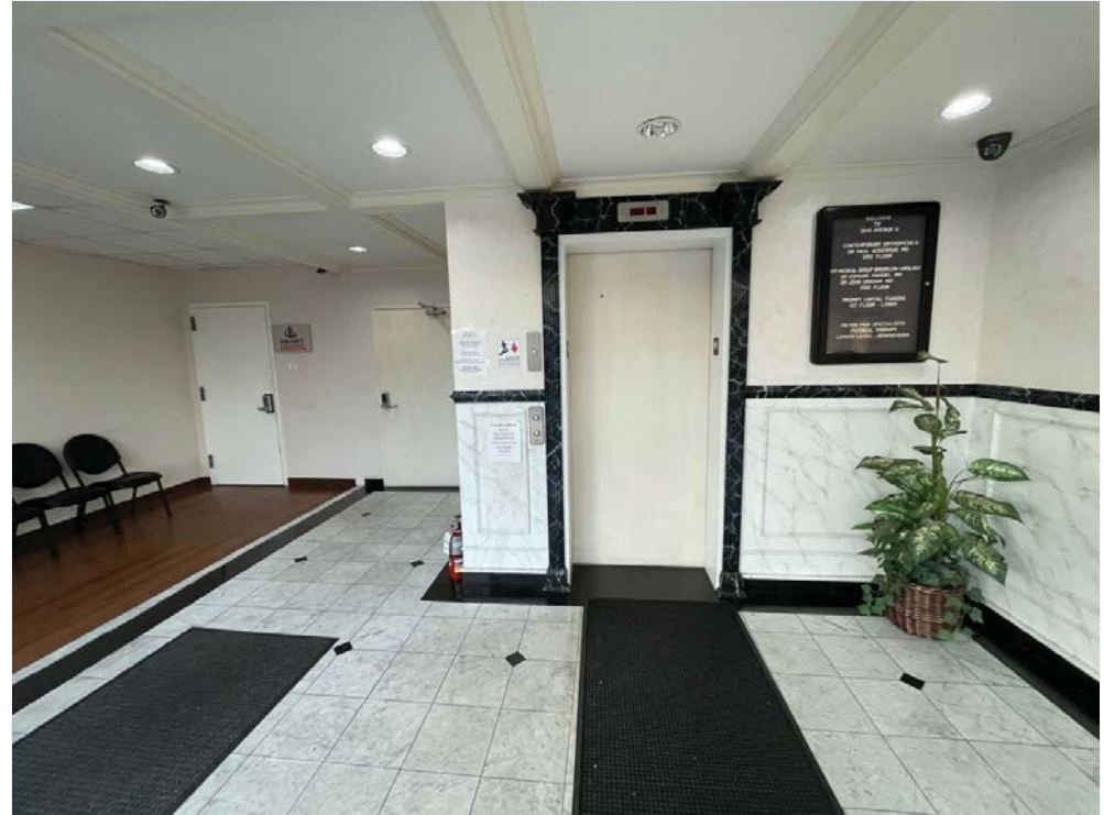
3041 Entrance Lobby