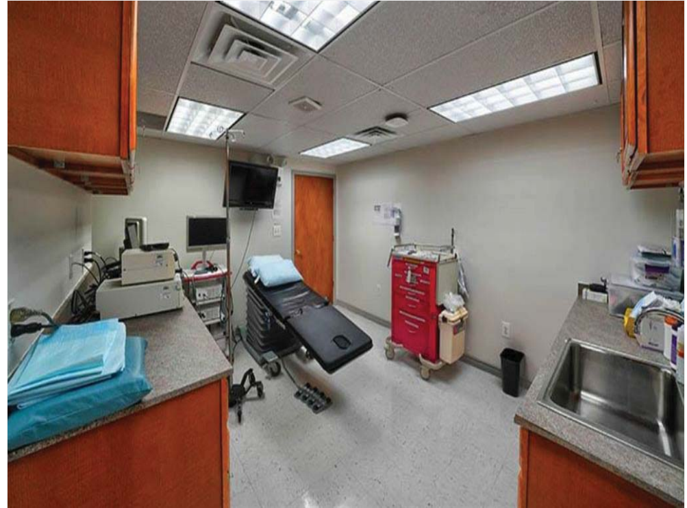
Office / Patient Room