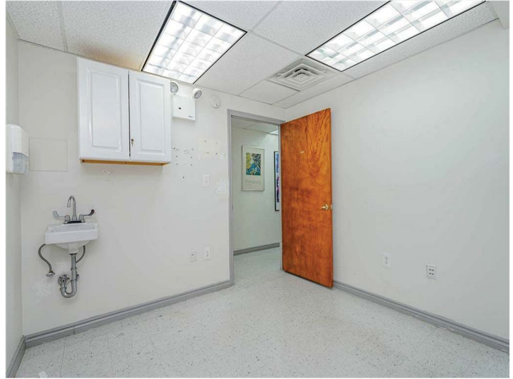
Office / Patient Room