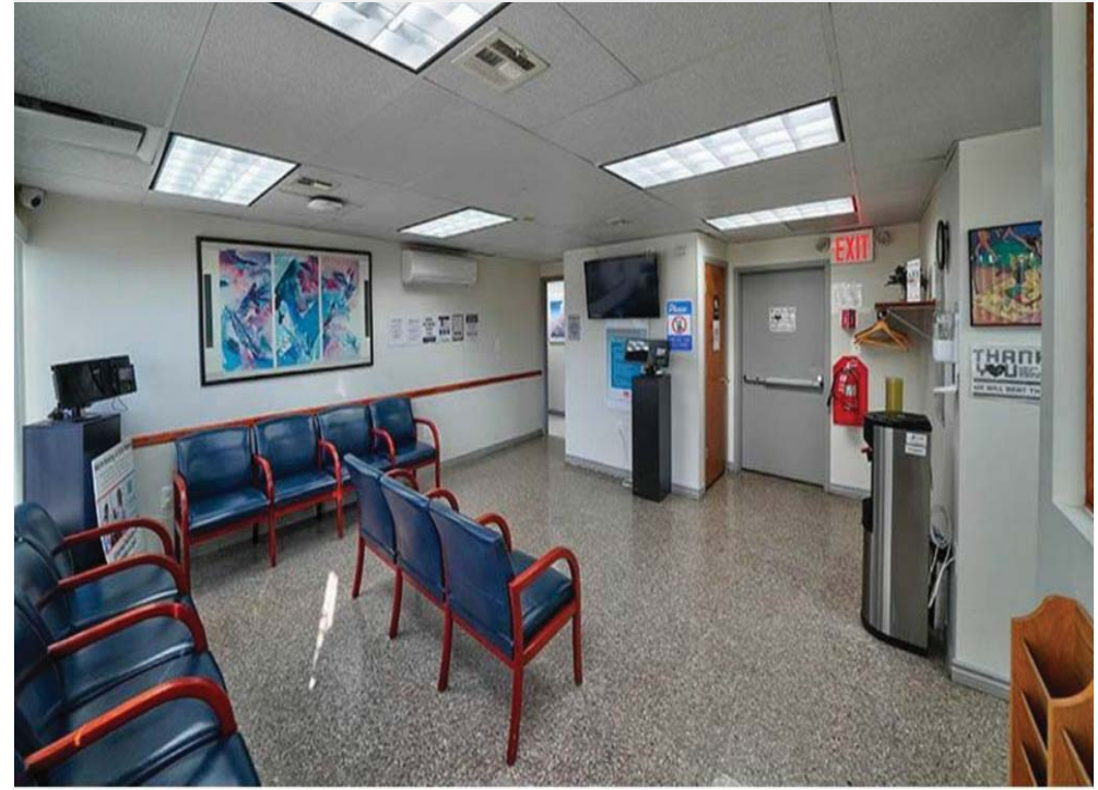
Reception / Entrance Waiting Area