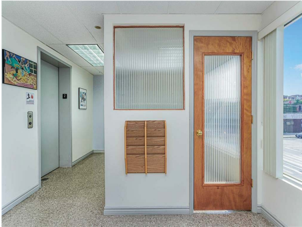
Front Desk Reception / Entrance