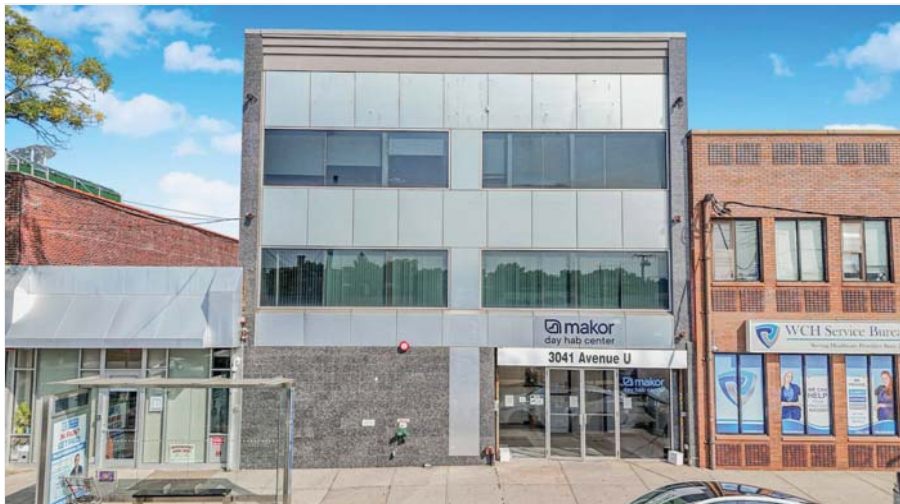
Office Space for Lease – Class A Medical/Professional Office Building on Avenue U

Take advantage of this brand-new Class A office space, available for immediate lease on the second floor of a newly constructed professional building.