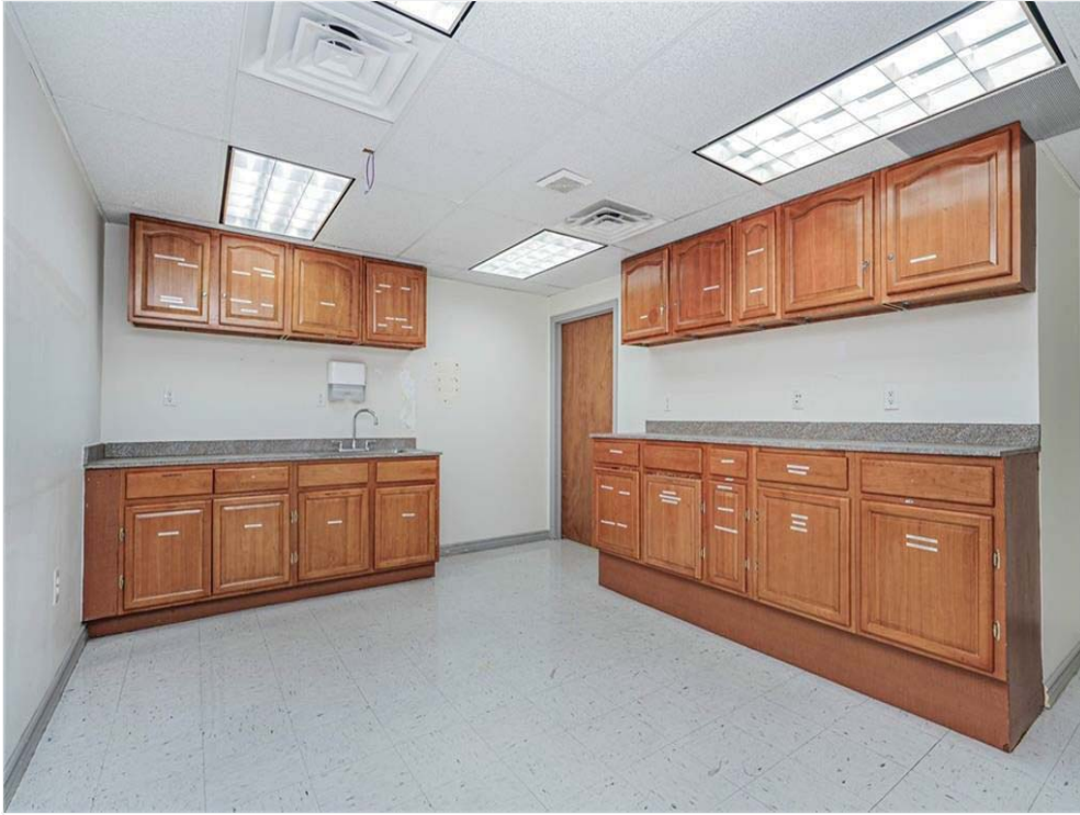
Office / Patient Room