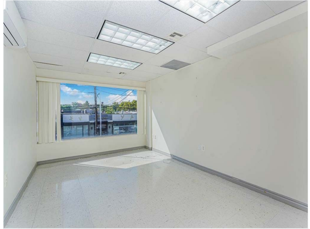
Office / Patient Room