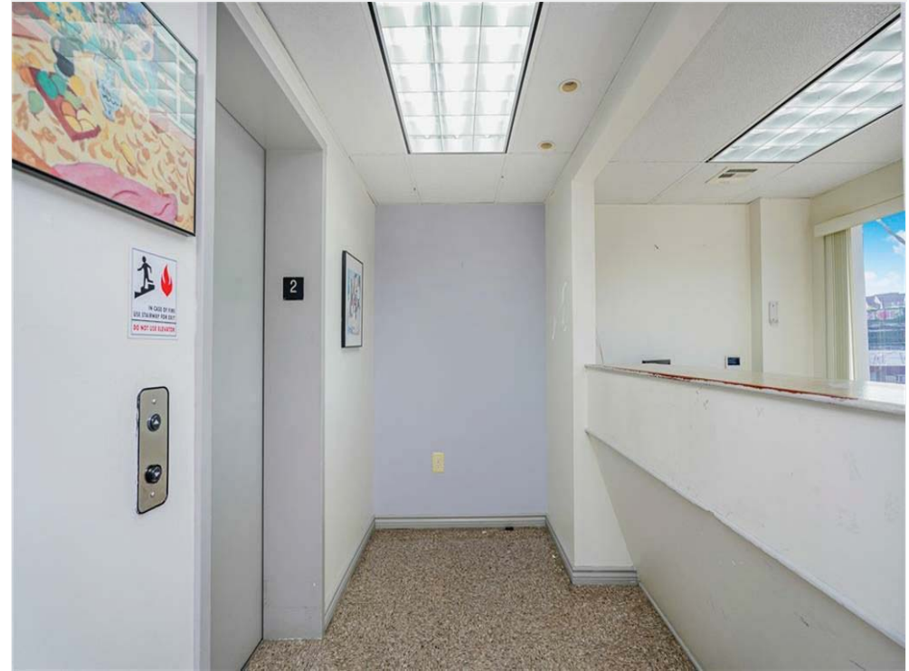
Reception / Entrance