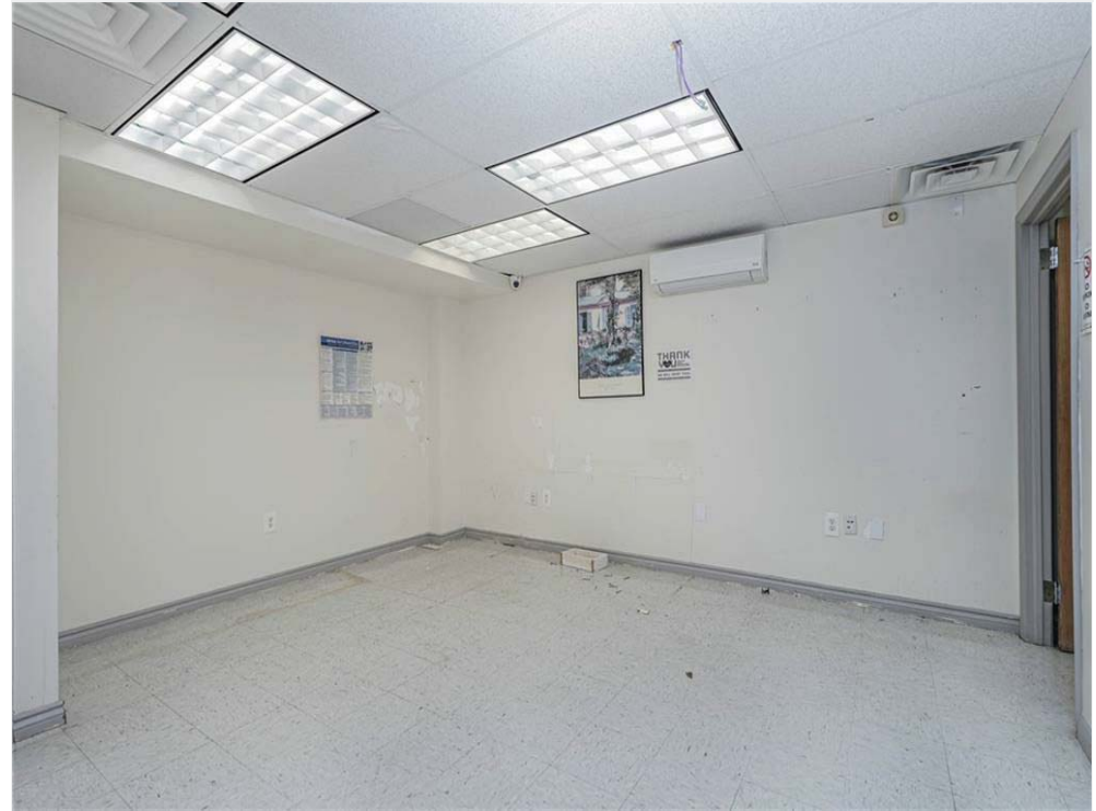
Office / Patient Room