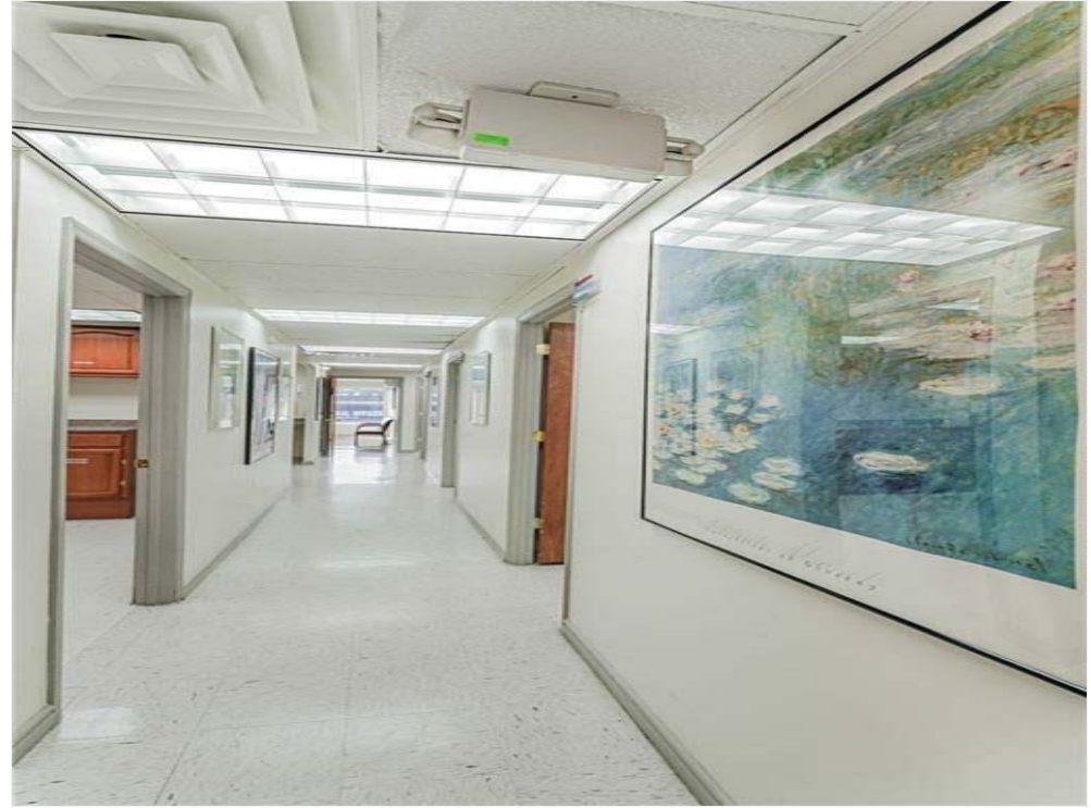
View of Hallway that leads to Patient Waiting Area