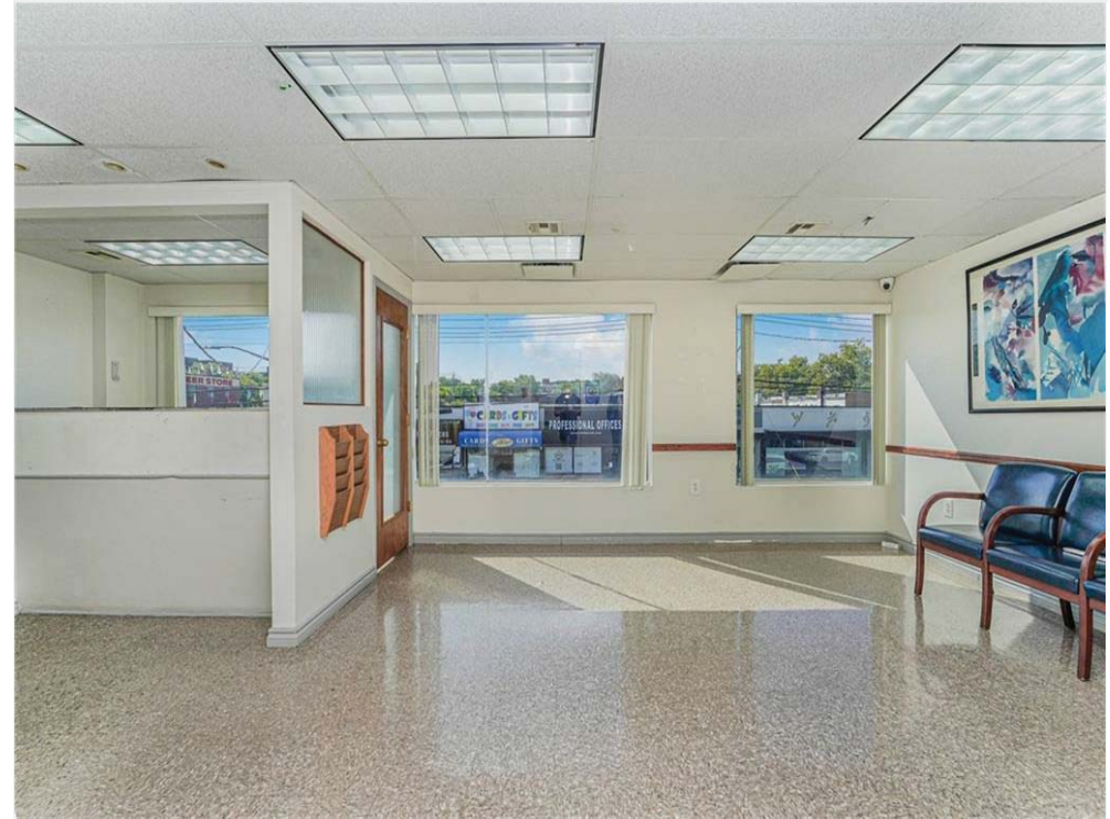
Reception / Patient Waiting Area