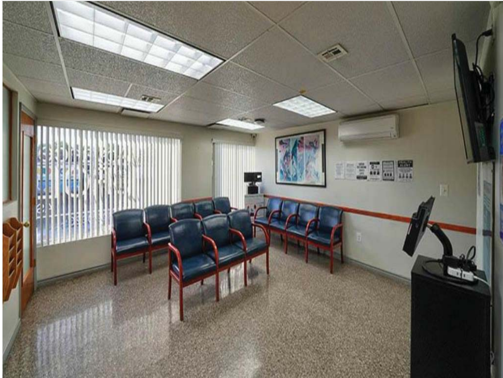
Reception / Entrance Waiting Area