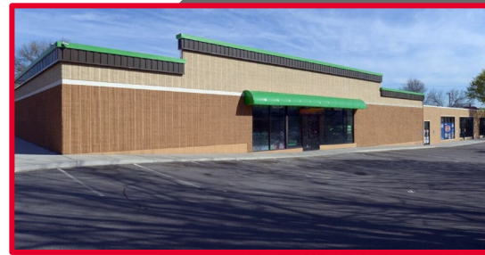
FRONT PAD RETAIL LOCATION