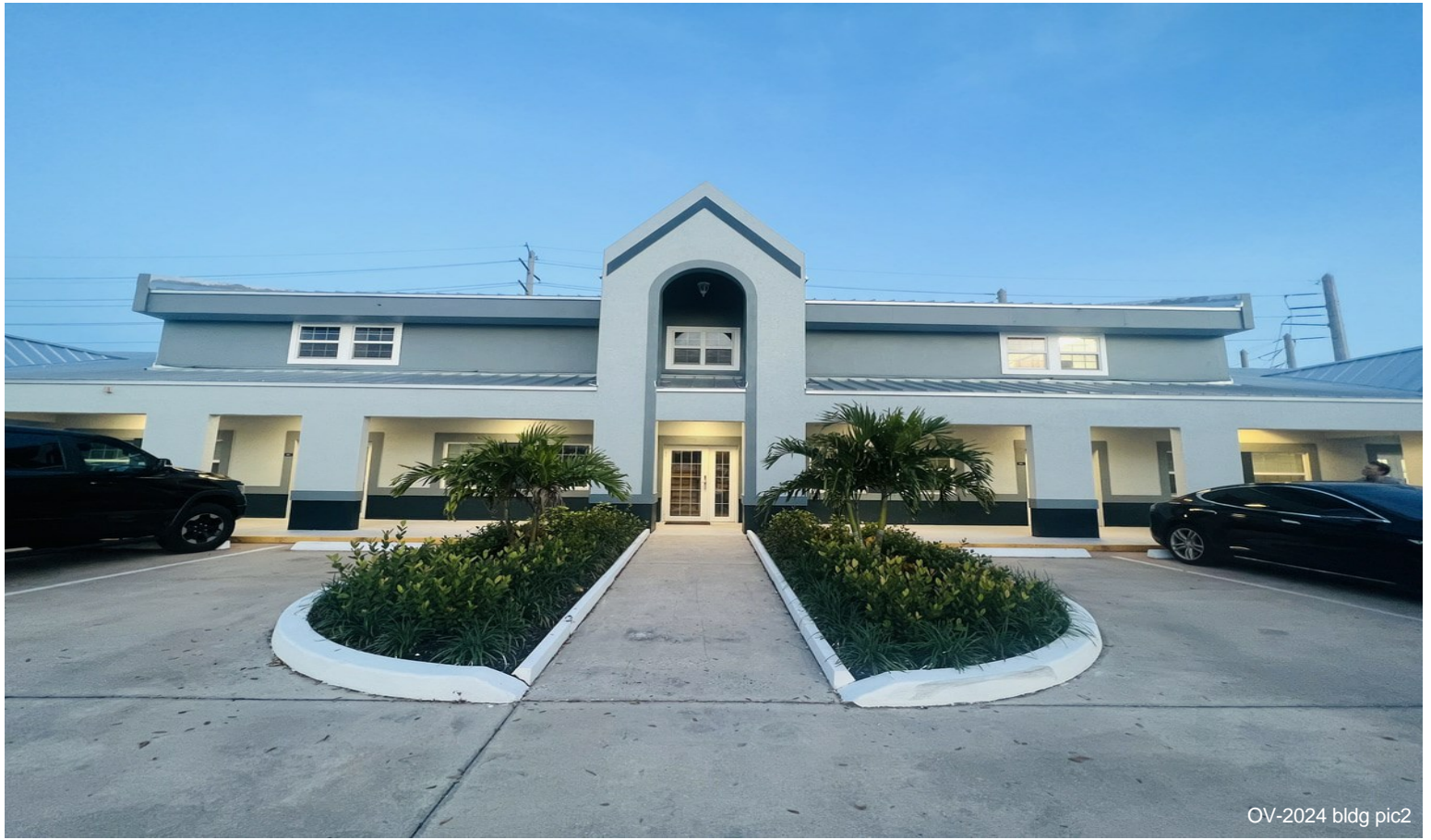
OV-2024 bldg pic2