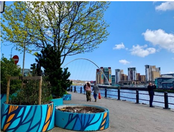
Quayside public realm, 1-min walk from suite *

There is an exceptional variety of restaurants and cafes in the immediate vicinity, Newcastle main retail district is approximately 5 minute walk from the property and therefore this location provides excellent amenities for any business.