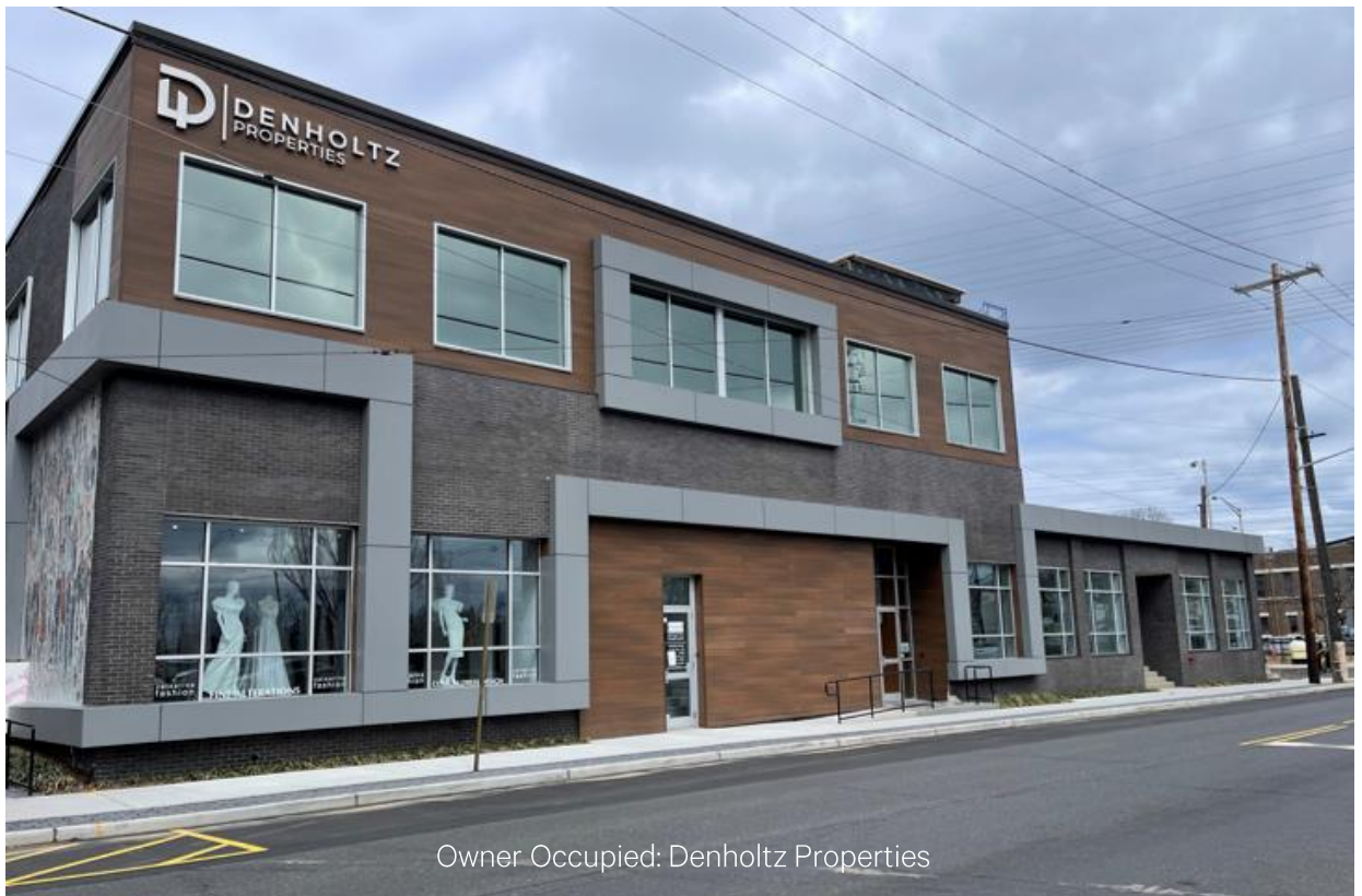
Owner Occupied: Denholtz Properties