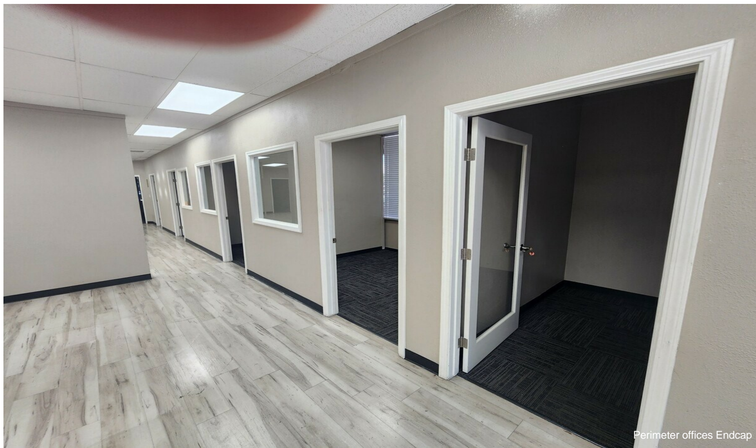
Perimeter offices Endcap