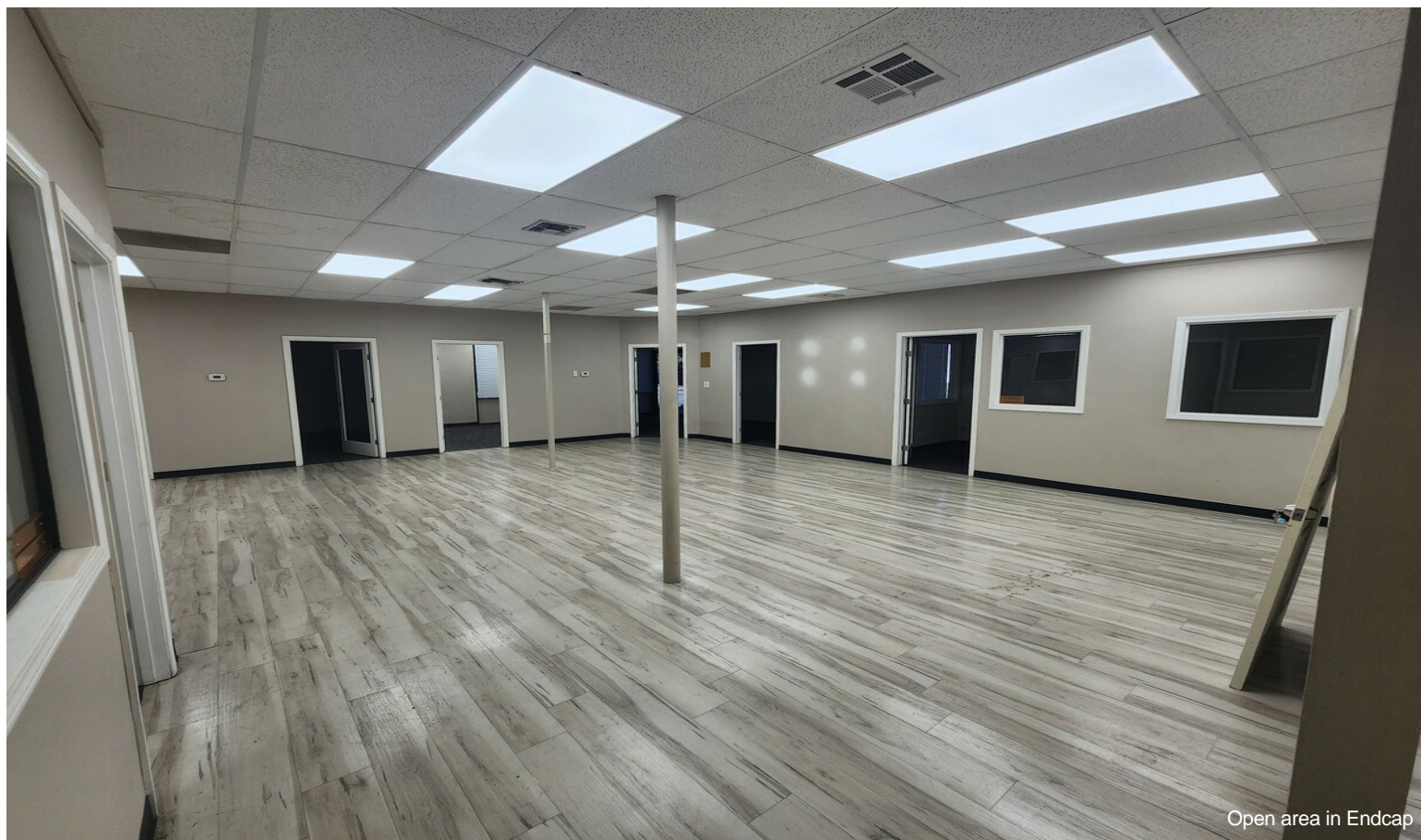
Open area in Endcap