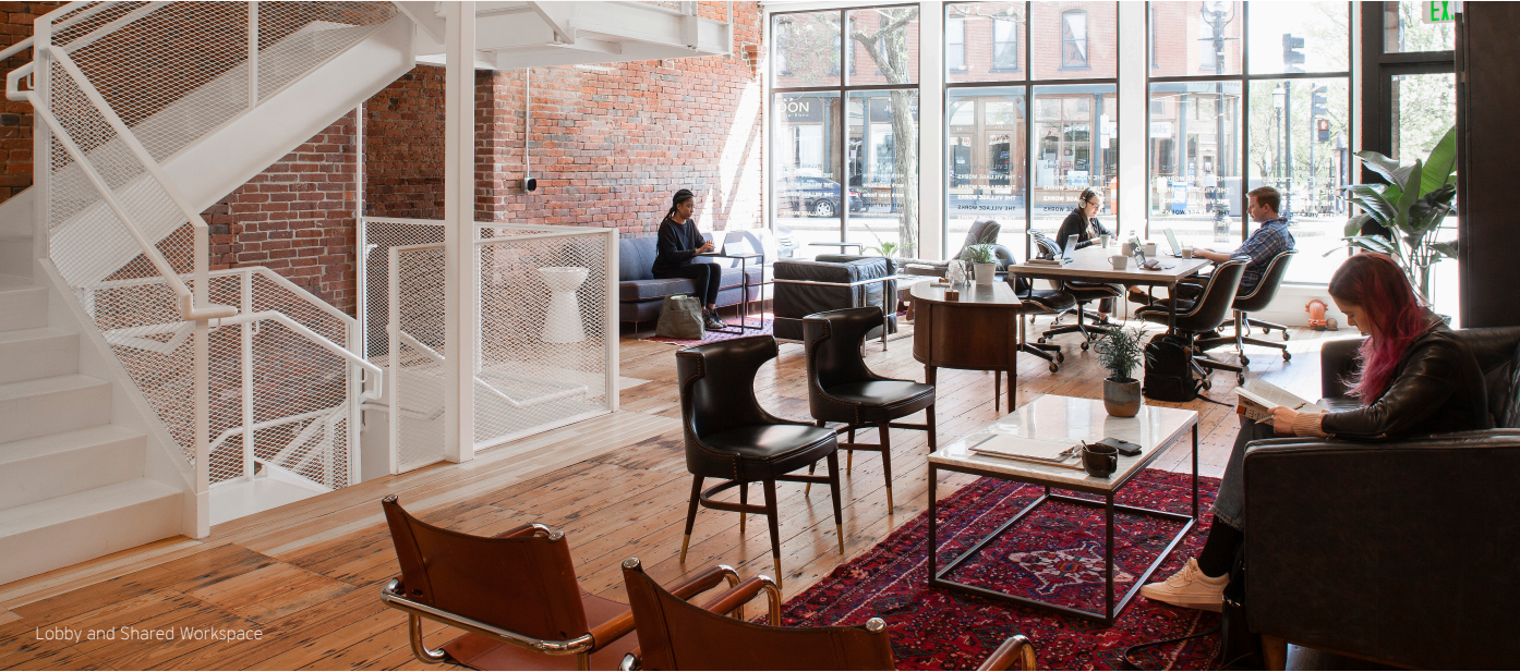
Lobby and Shared Workspace