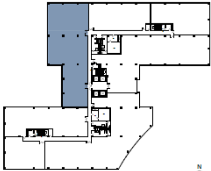
FLOOR LOCATION PLAN