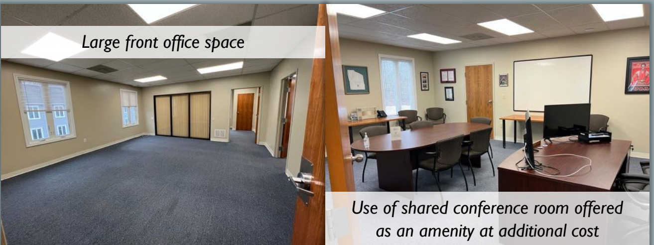
Large front office space