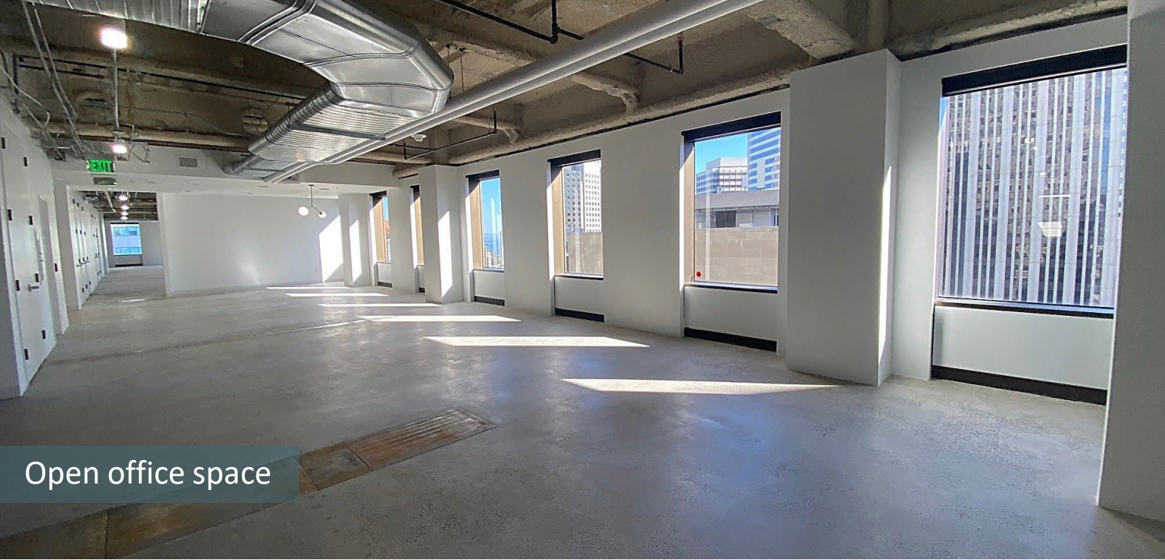
Open office space