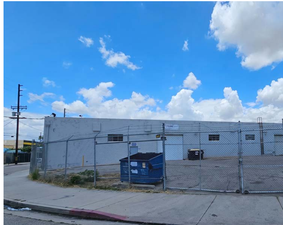
Large Private Gated Yard