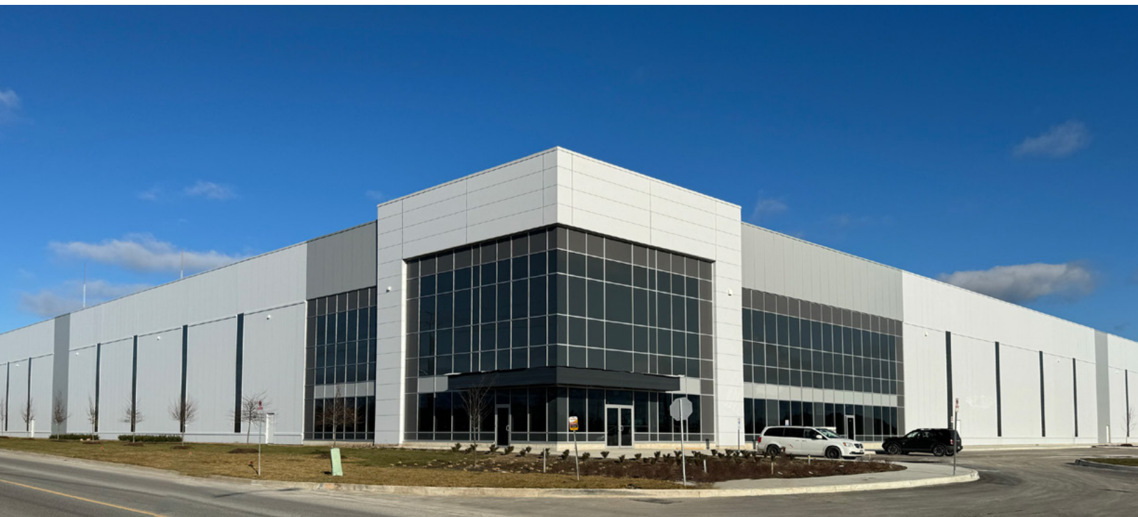
PHASE I READY FOR FIXTURING