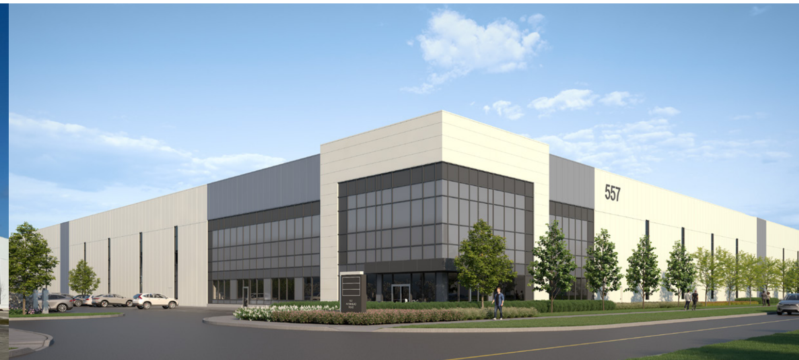
PHASE II DELIVERY Q2 2025