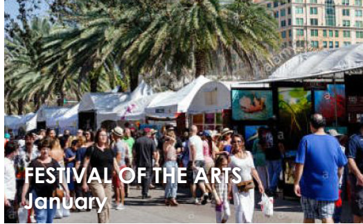
FESTIVAL OF THE ARTS January