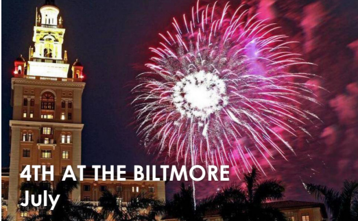
4TH AT THE BILTMORE July