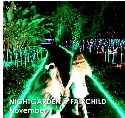
NIGHTGARDEN @ FAIRCHILD November