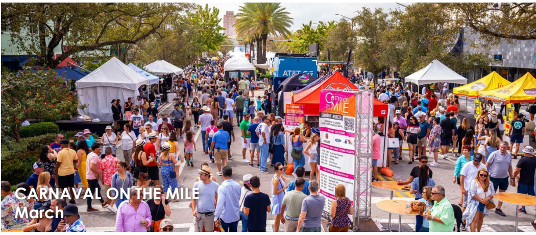
CARNAVAL ON THE MILE March