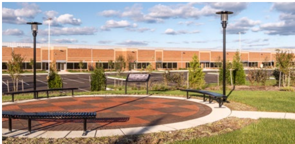
Erco Memorial Park

For more information on Rivertech Court at the Discovery District, visit: sjpi.com/rivertechcourt