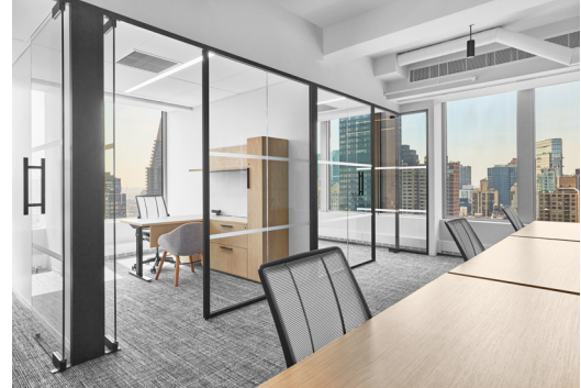
TAKE A VIRTUAL TOUR