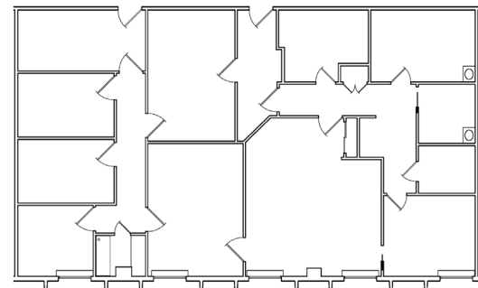
Suite 404 | 2,330 SF

For more information or to schedule a property tour, please contact: