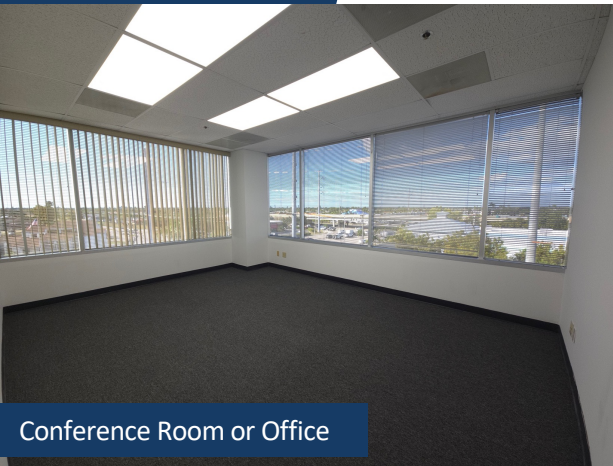
Conference Room or Office