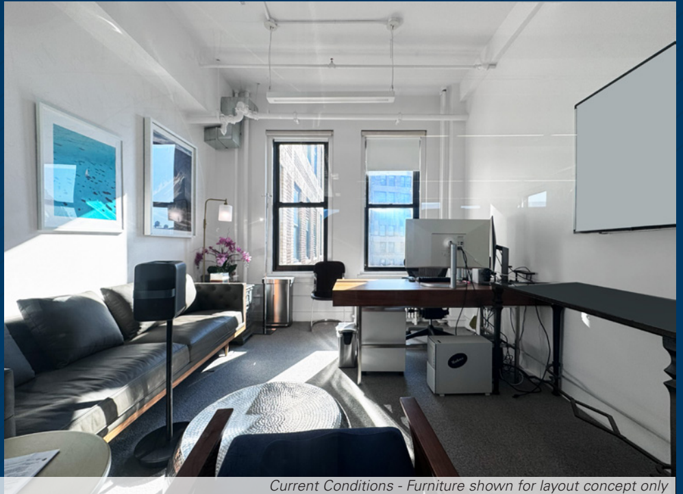
Current Conditions - Furniture shown for layout concept only

ABS Partners Real Estate, as the exclusive agent is pleased to offer the following opportunity for lease: