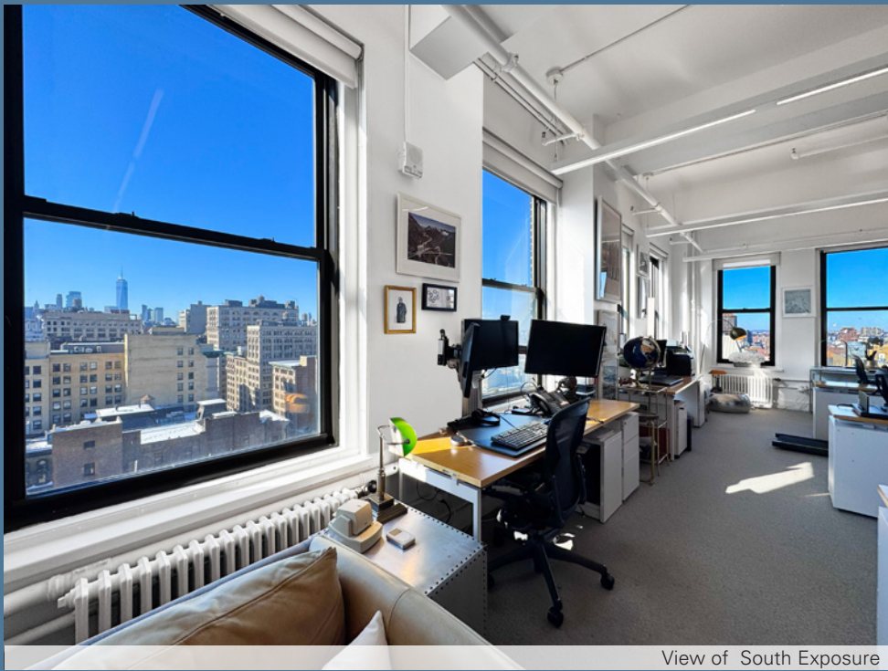
View of South Exposure