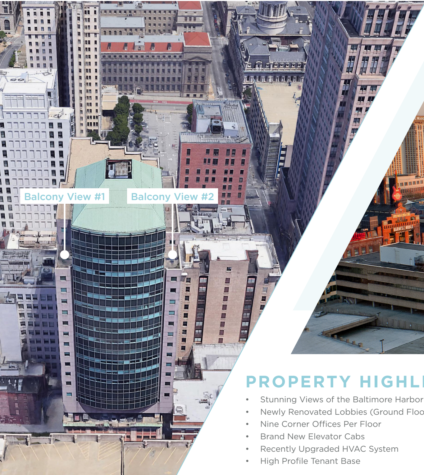
Balcony View #1