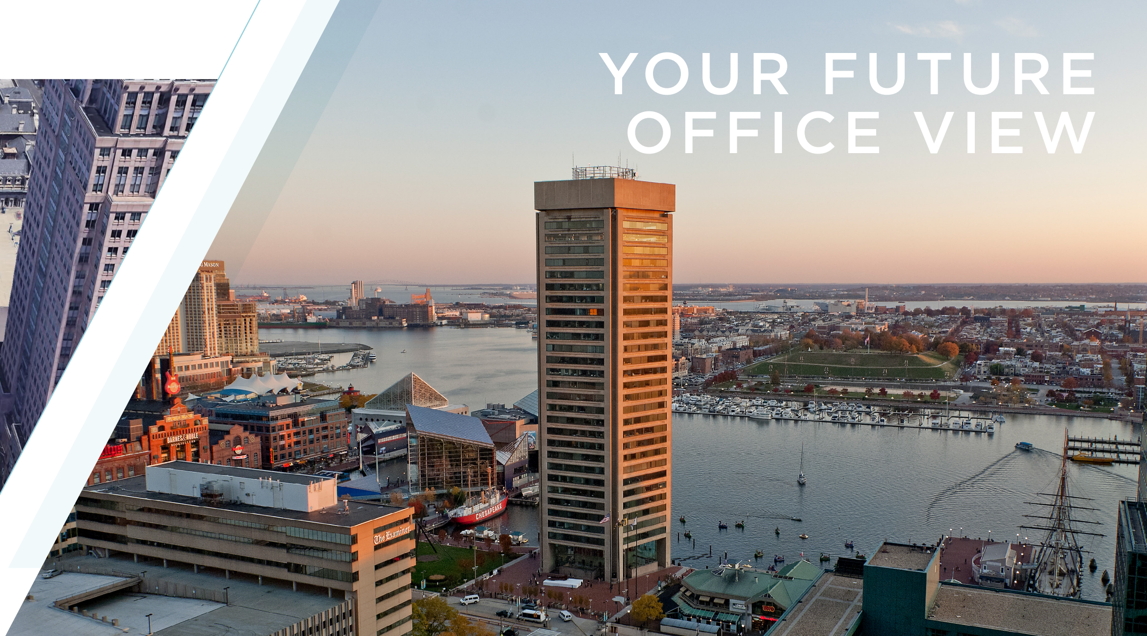
Balcony View #2