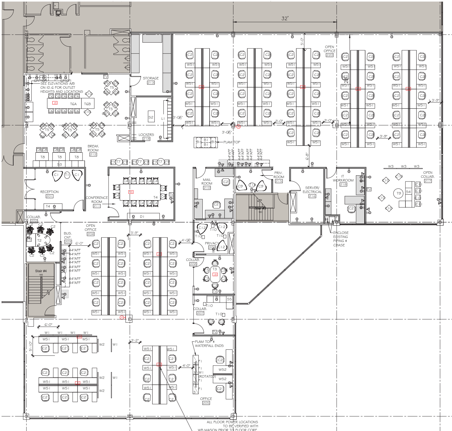
A FURNITURE AND ELECTRICAL PLAN 1/8" = 1'-0"