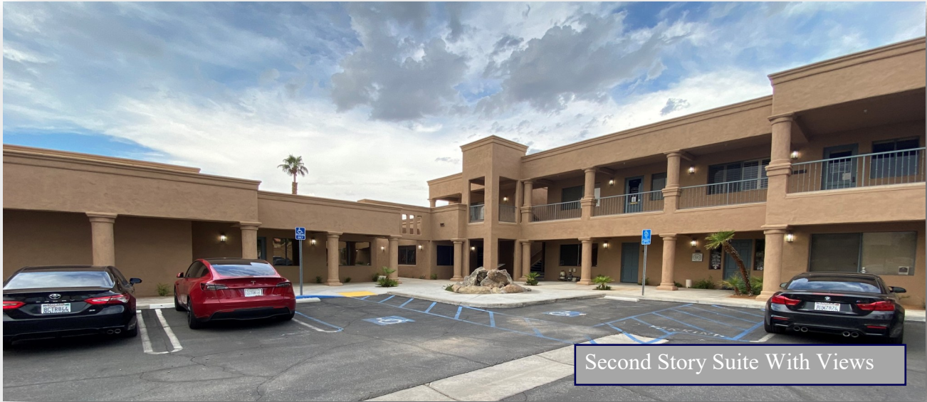
Second Story Suite With Views