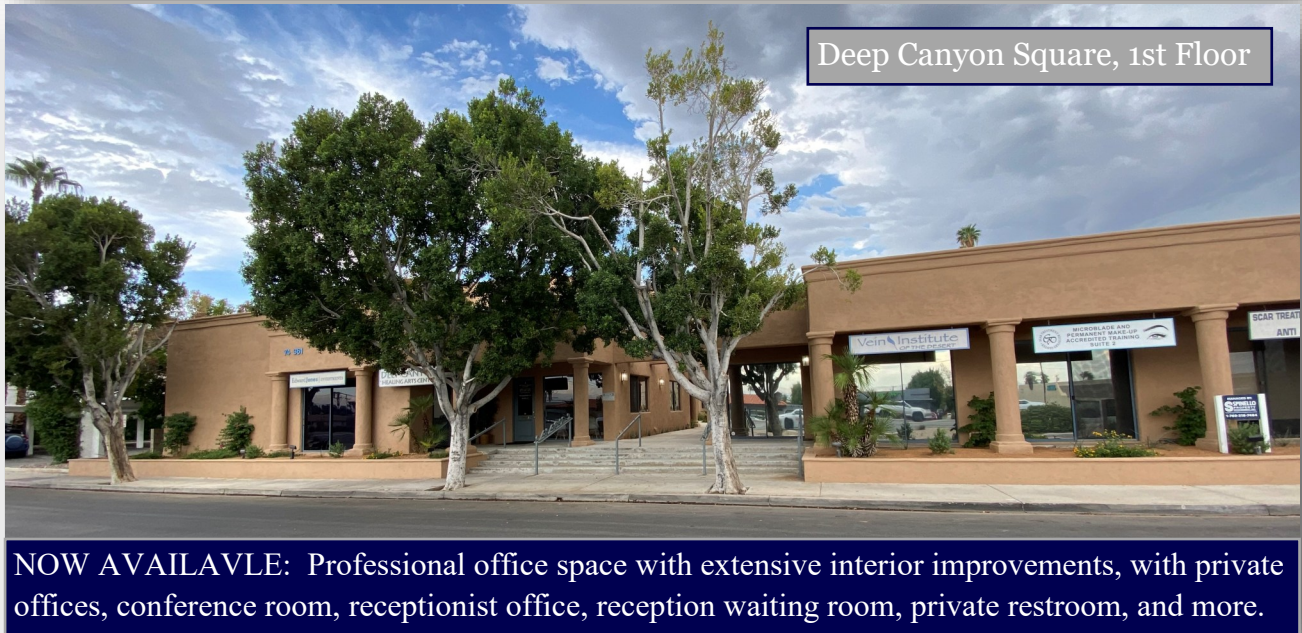
Deep Canyon Square, 1st Floor

NOW AVAILABLE: Professional office space with extensive interior improvements, with private offices, conference room, receptionist office, reception waiting room, private restroom, and more.