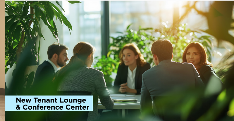
New Tenant Lounge & Conference Center