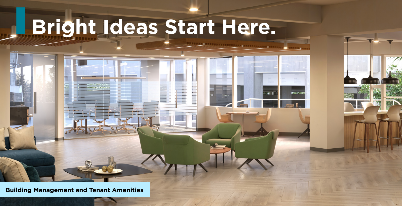
Building Management and Tenant Amenities