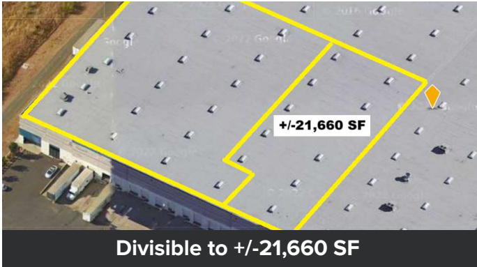
Divisible to +/-21,660 SF