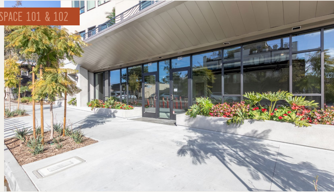
SPACE 101 & 102