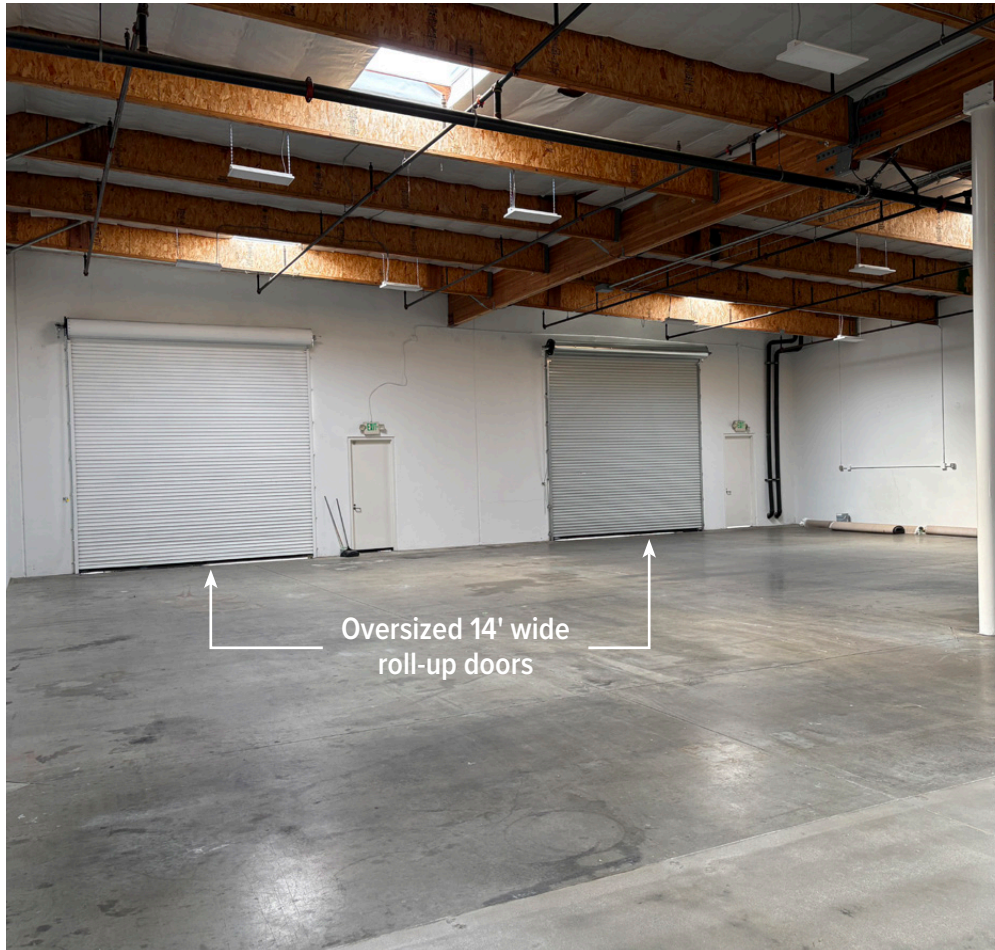
Oversized 14' wide roll-up doors