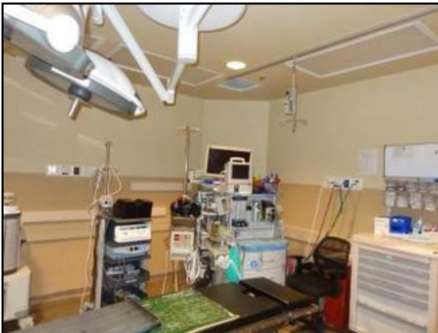
View: First of two surgery rooms