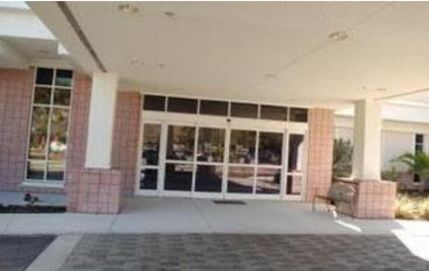
Entrance to Foot and Ankle Group