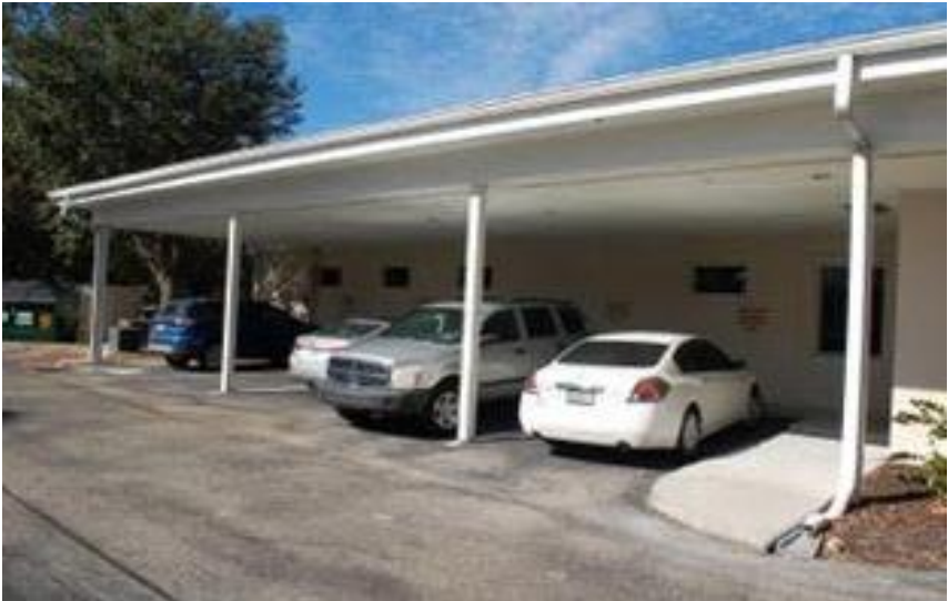
South Side private entrance for doctors