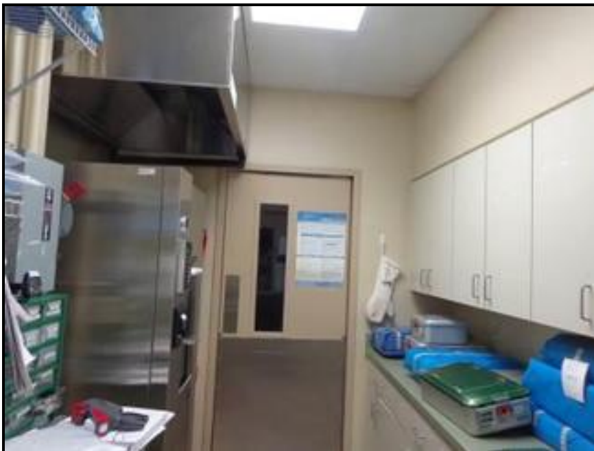
View: Nurses station inside sterile area