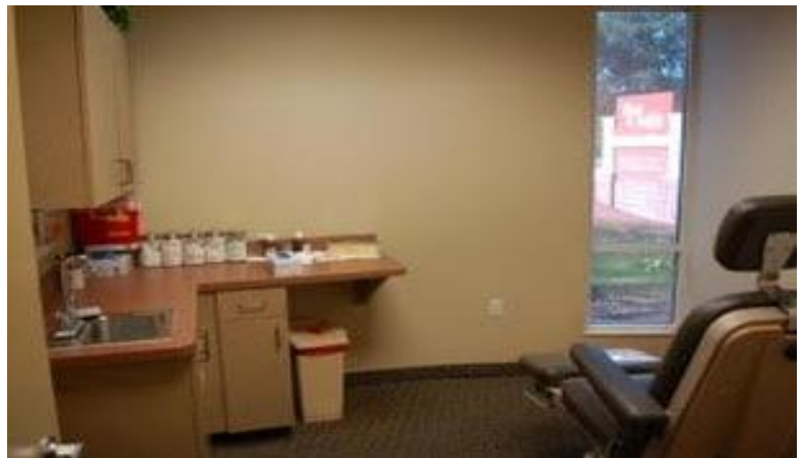
Podiatry office photos