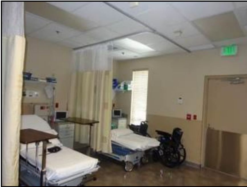
View: Recovery room