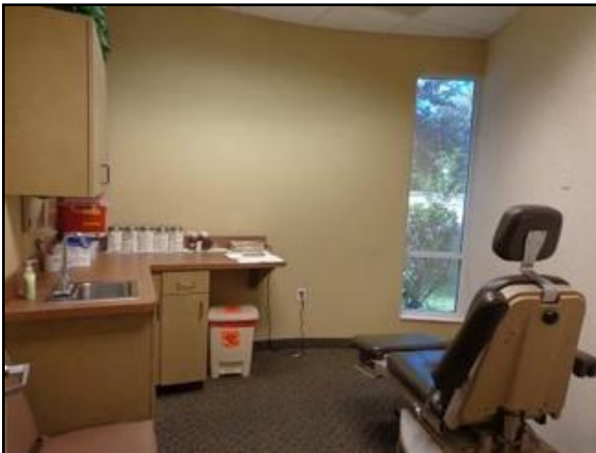
View: Typical exam room, note built-in cabinetry and sink