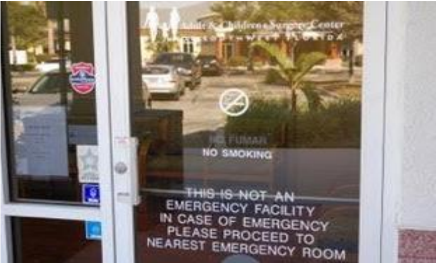
Entrance to Surgery Center