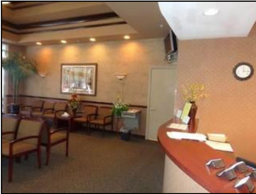
View: Waiting room area