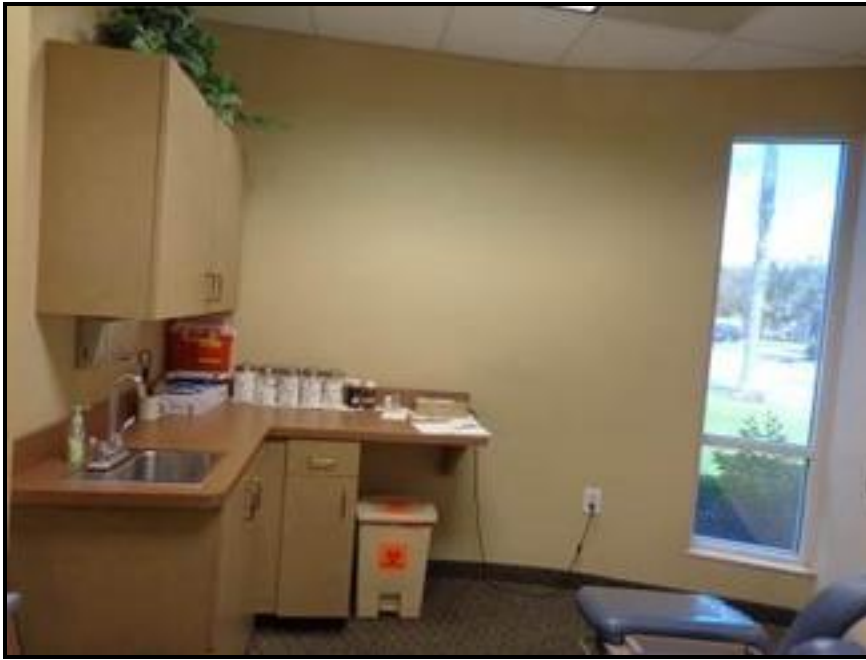
View: Typical exam room, note built-in cabinetry and sink