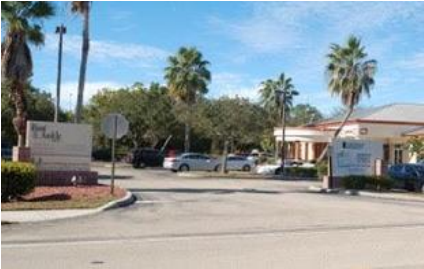
Mason Corbin Court entrance