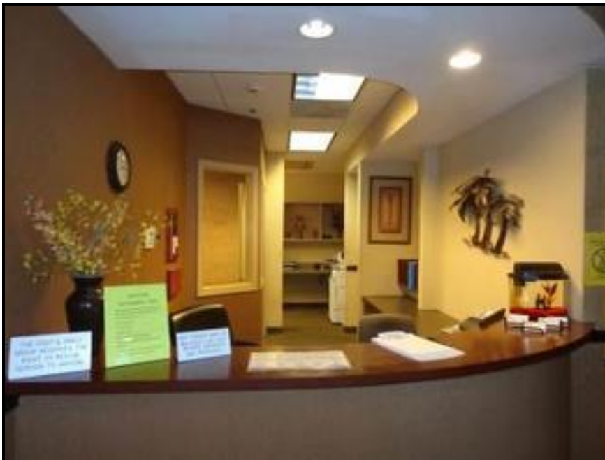
View: Receptionist desk