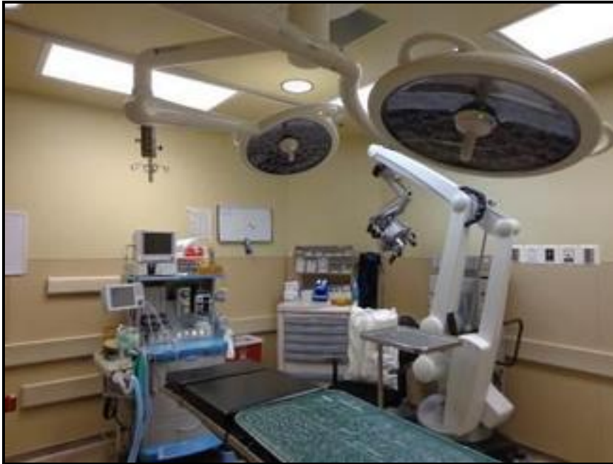
View: Second of two surgery rooms