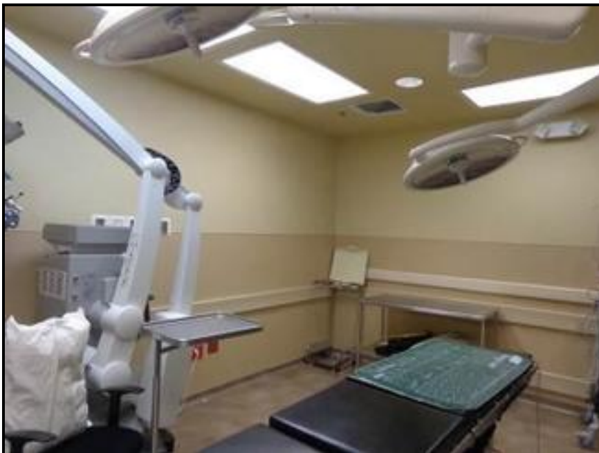
View: Second of two surgery rooms