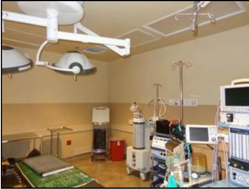
View: First of two surgery rooms