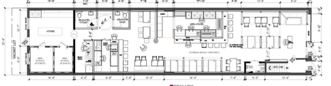
PROPOSED FLOOR PLAN @ FIRST FLOOR