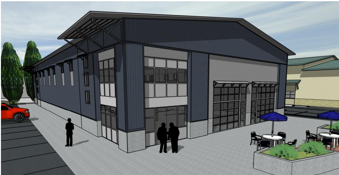
Rendering at Main Entry

New 10,688 SqFt Solar-Powered Building Available 2023