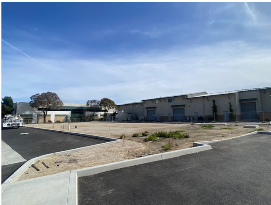
Building Pad ready for footings