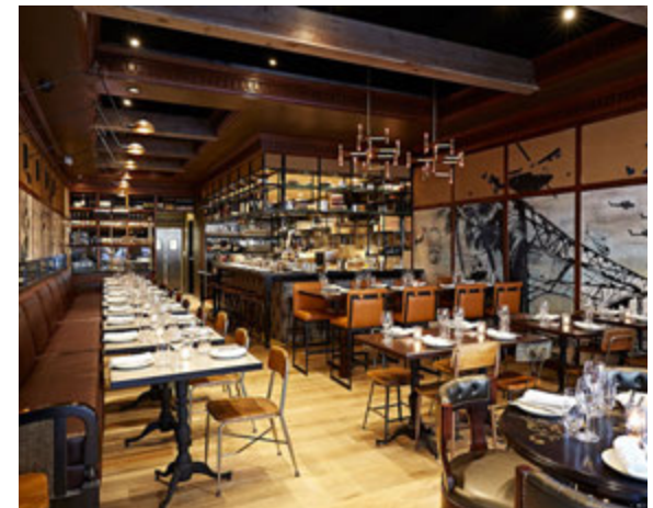
📍 LITTLE SISTER