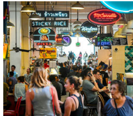
📍 GRAND CENTRAL MARKET