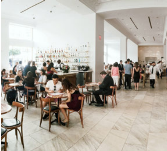
📍 BOTTEGA LOUIE