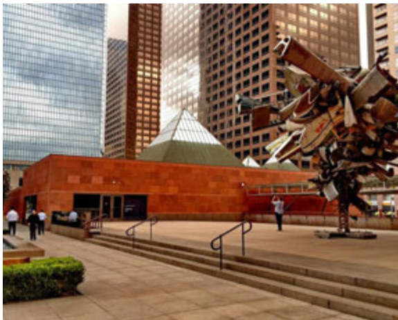
📍 MOCA MUSEUM