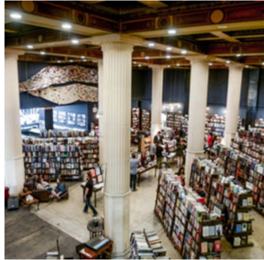
📍 LAST BOOKSTORE