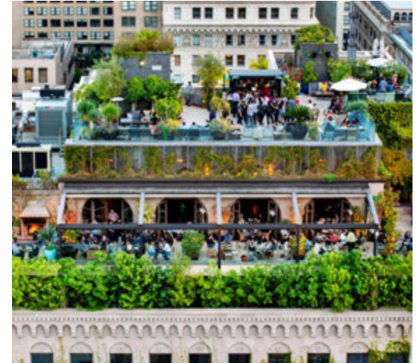
📍 PERCH LOS ANGELES