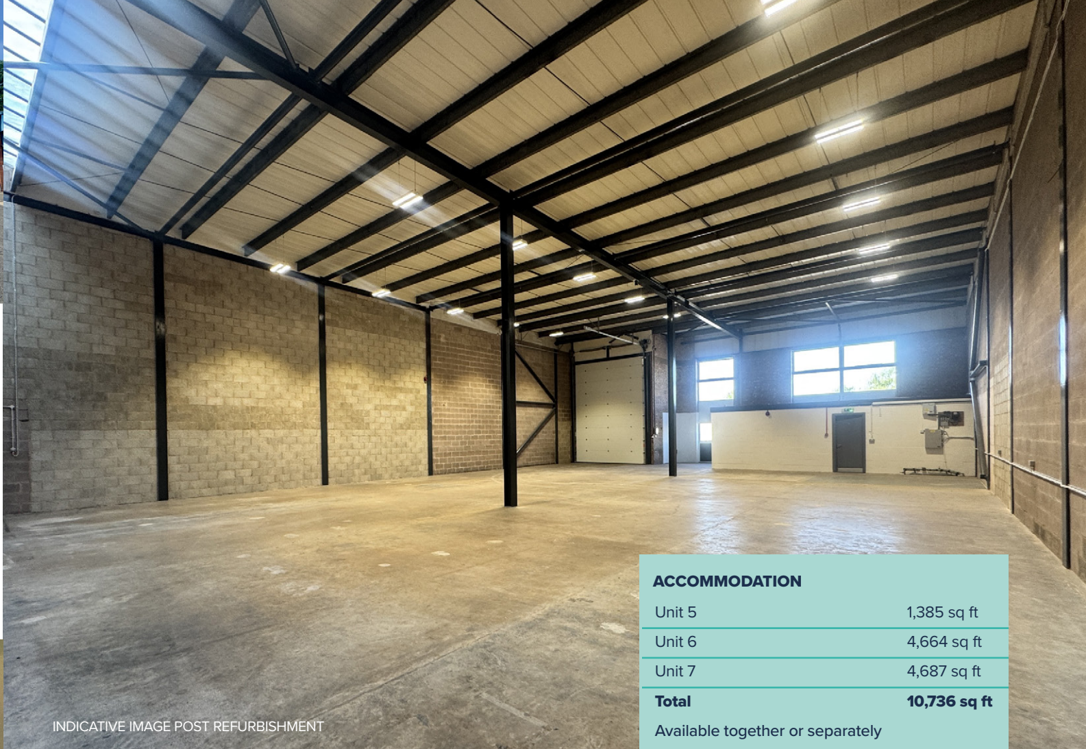
INDICATIVE IMAGE POST REFURBISHMENT