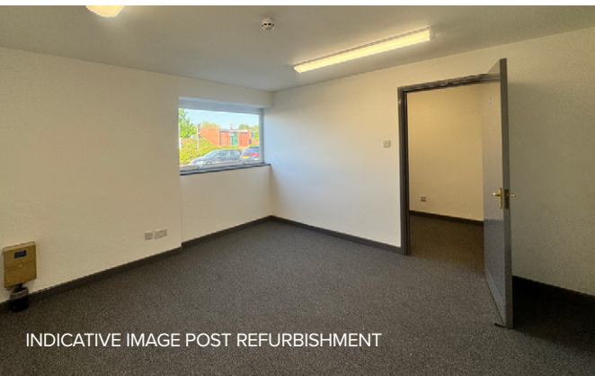
INDICATIVE IMAGE POST REFURBISHMENT

Units 5, 6 & 7 comprise units of steel frame construction with block and brick infill. Each unit has a ground floor loading door together with a concrete and brick surfaced yard.