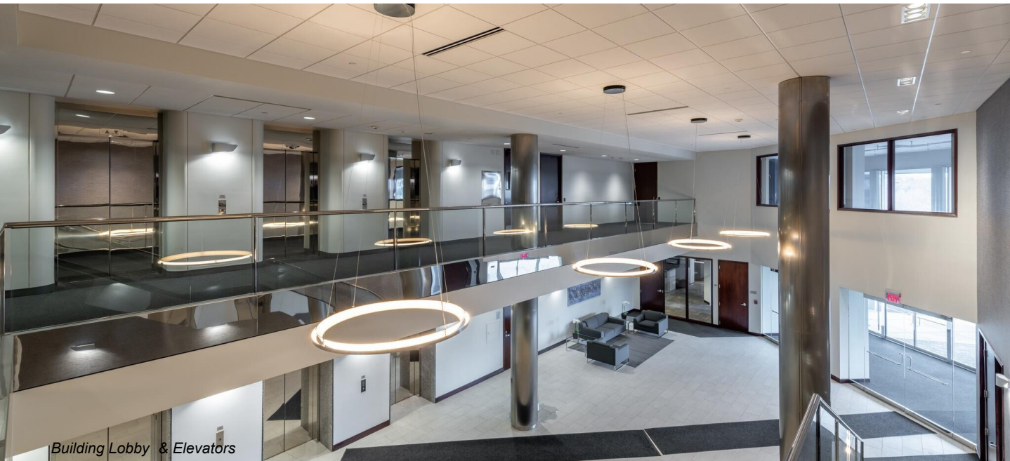
Building Lobby & Elevators