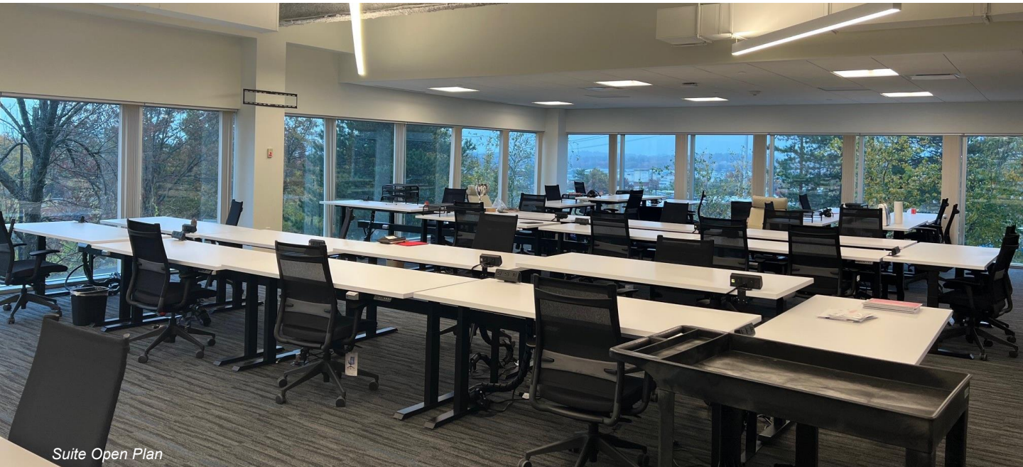
Suite Open Plan