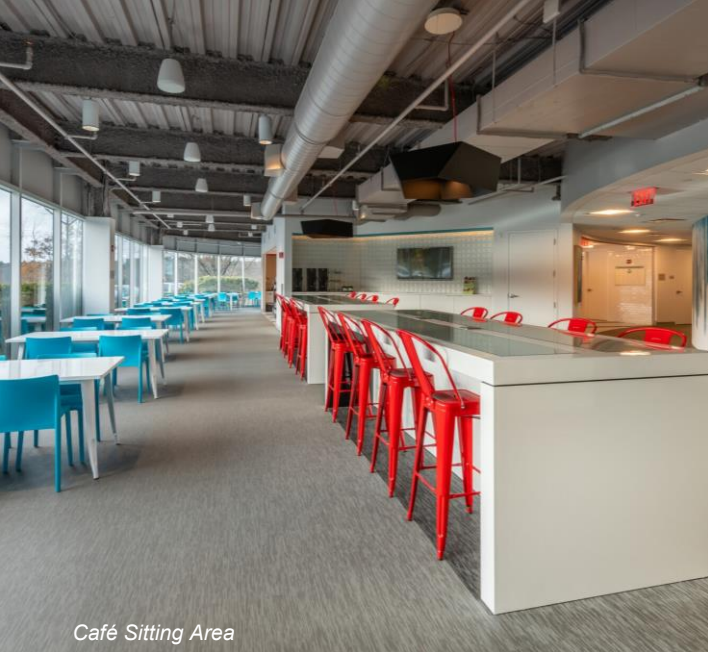
Café Sitting Area