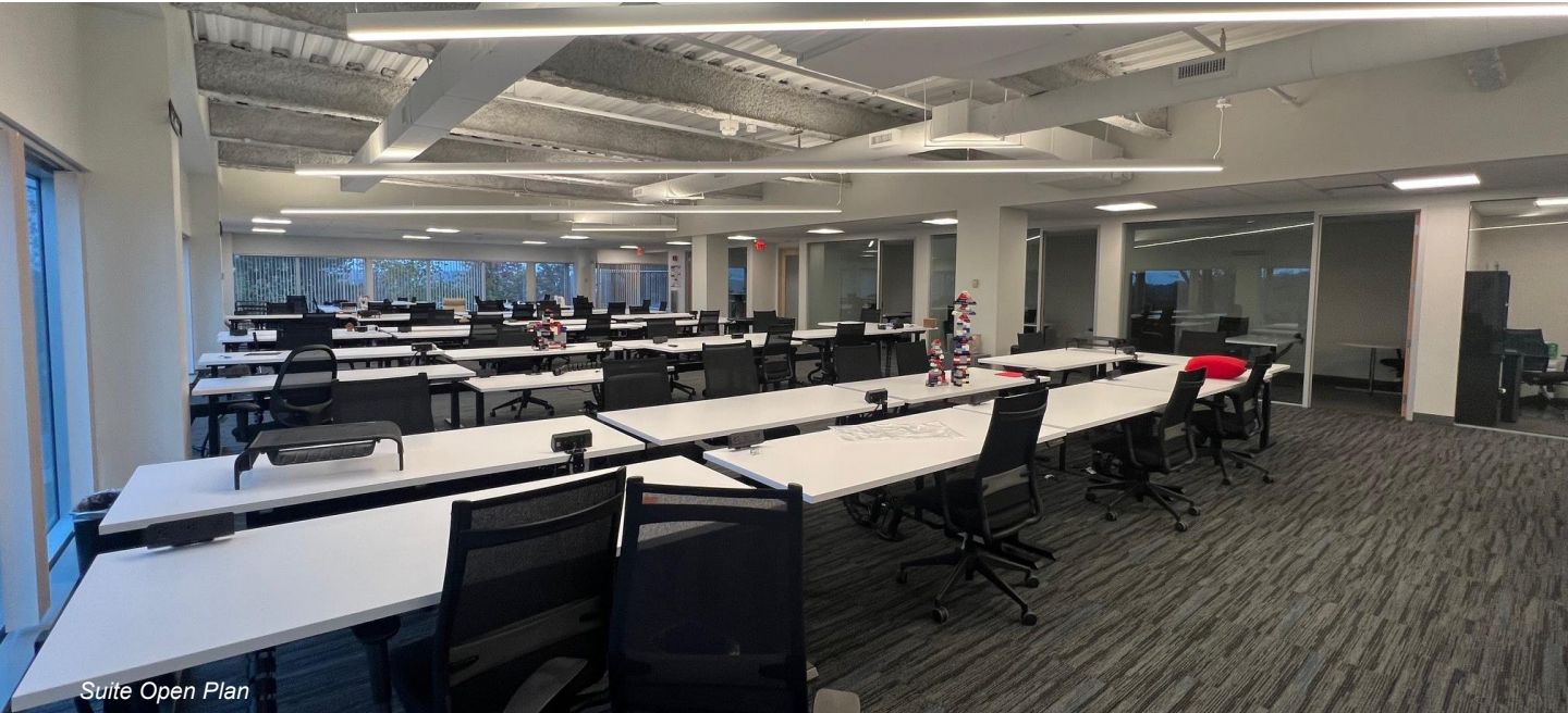
Suite Open Plan