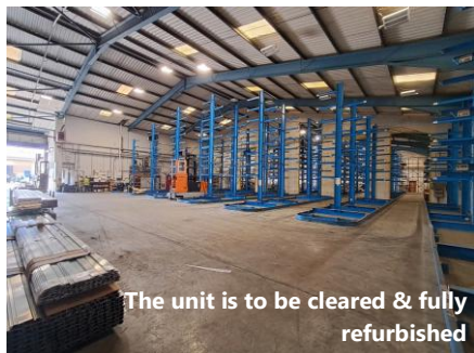
The unit is to be cleared & fully refurbished