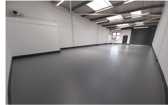
Photos are indicative of a refurbished unit on the estate.