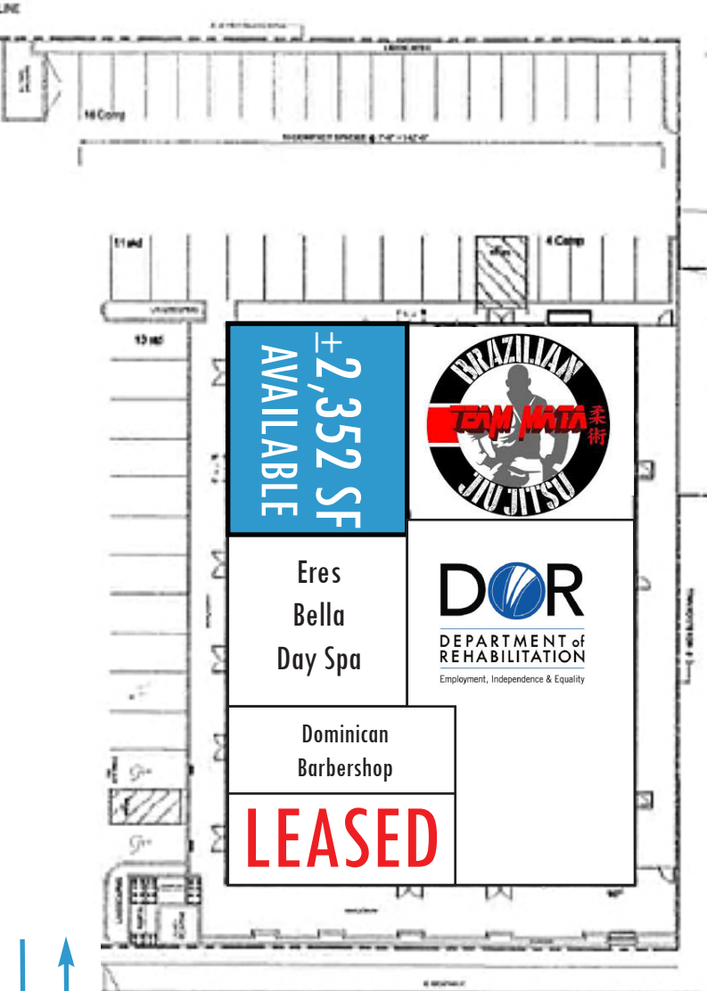
Site plan not to scale