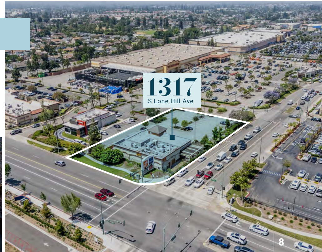
1317 S LONE HILL AVE