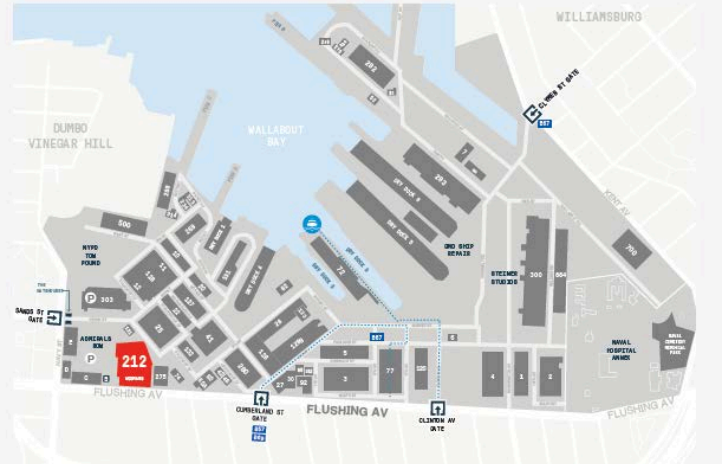
BLDG 212 LOCATION