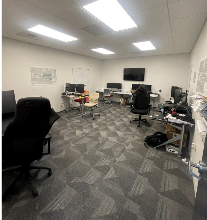
Downtown Harbor - 21,000 SF Flex Industrial Plus Yard For Lease