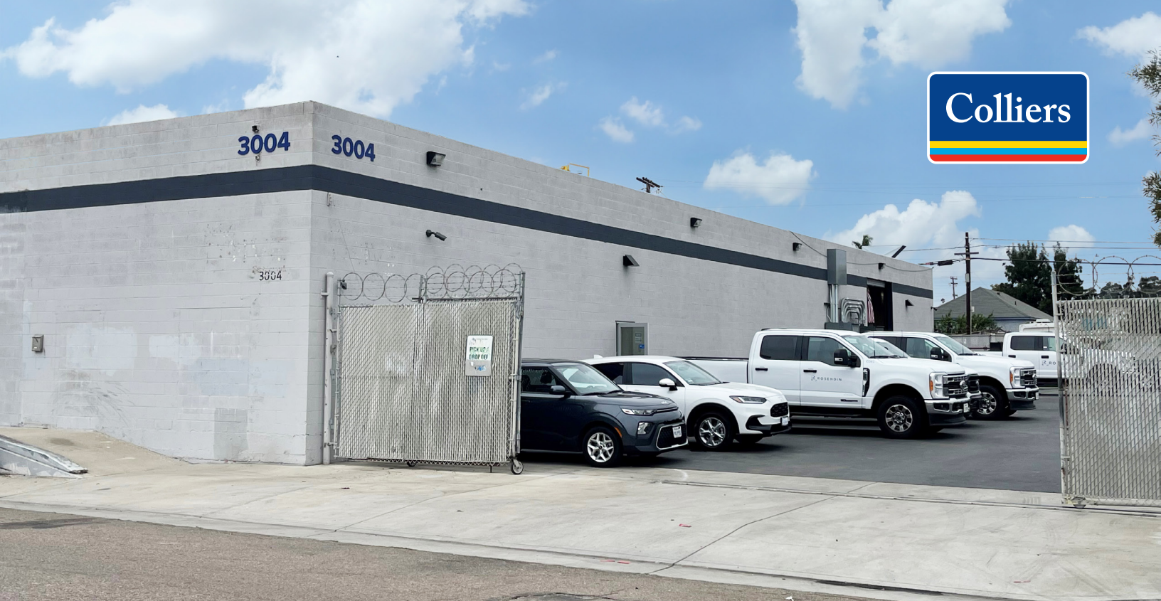
Downtown Harbor - 21,000 SF Flex Industrial Plus Yard For Lease