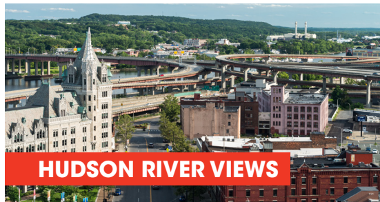
HUDSON RIVER VIEWS