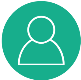
YOUR OWN OFFICE