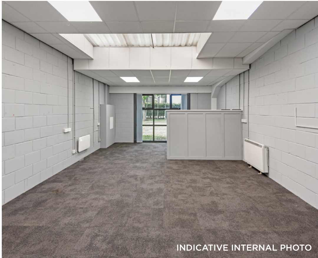
INDICATIVE INTERNAL PHOTO