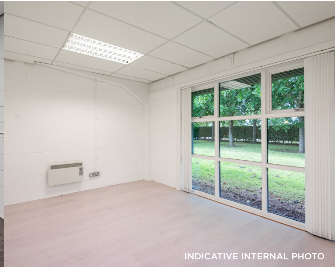
INDICATIVE INTERNAL PHOTO