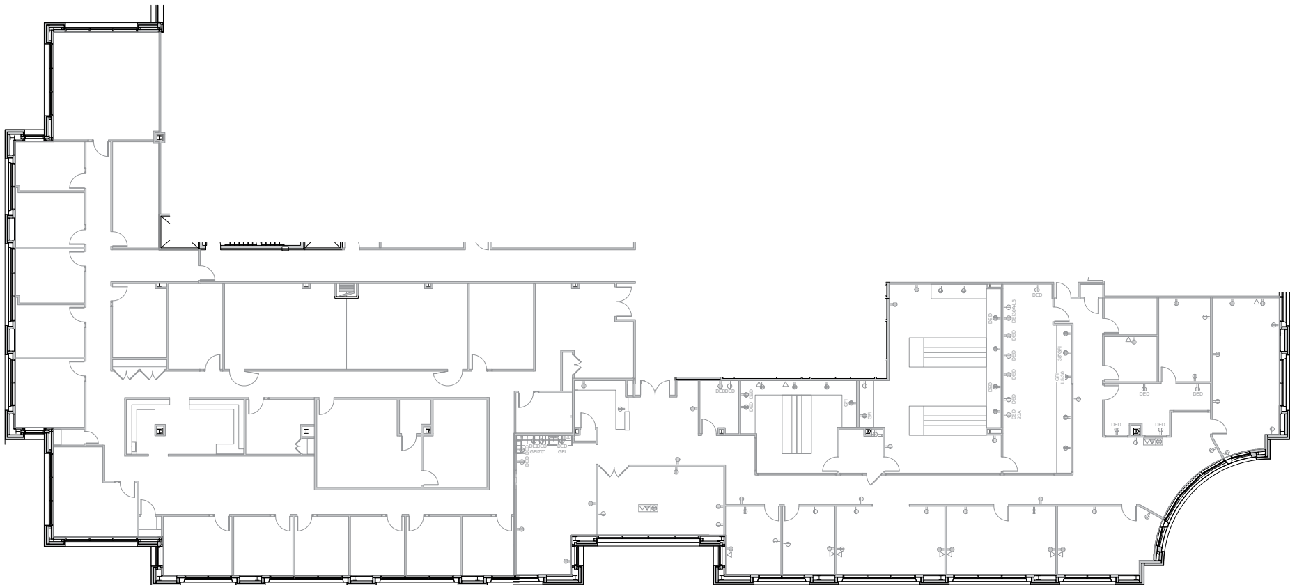
MAPLE LAWN BOULEVARD

Note: This space plan is subject to existing field conditions. This drawing is proprietary and the exclusive property of St. John Properties, Inc. Any duplications, distribution, or other unauthorized use is strictly prohibited.