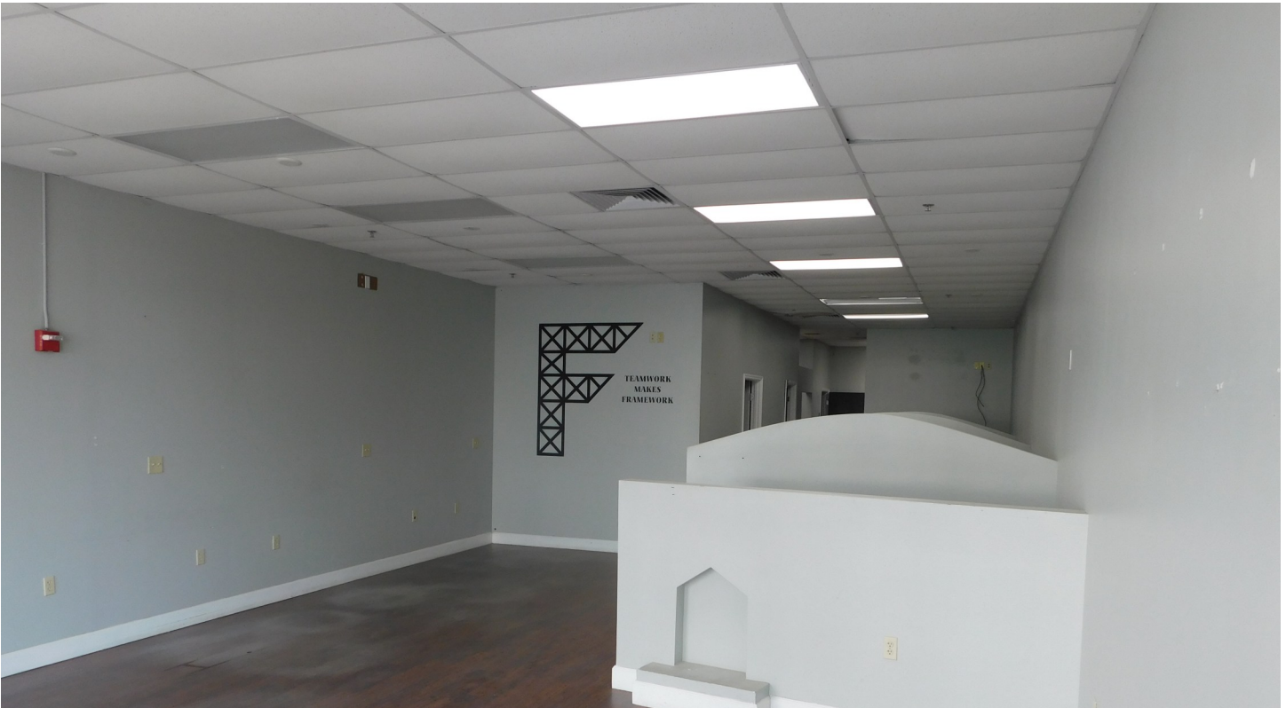
Suite 104 - 1,400 SF