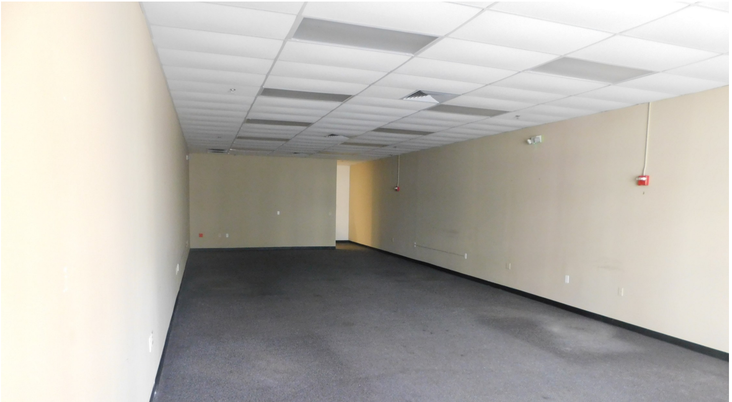
Suite 103 - 1,400 SF