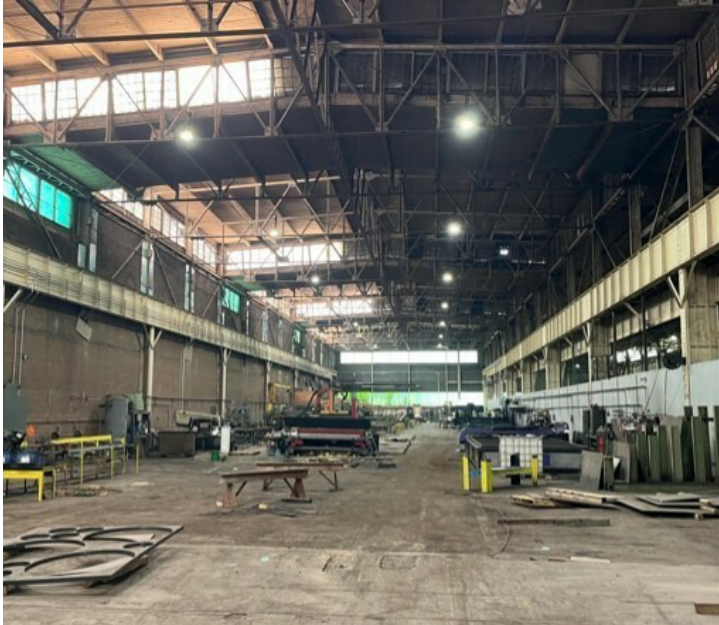
Bay B: 28,080 Square Feet