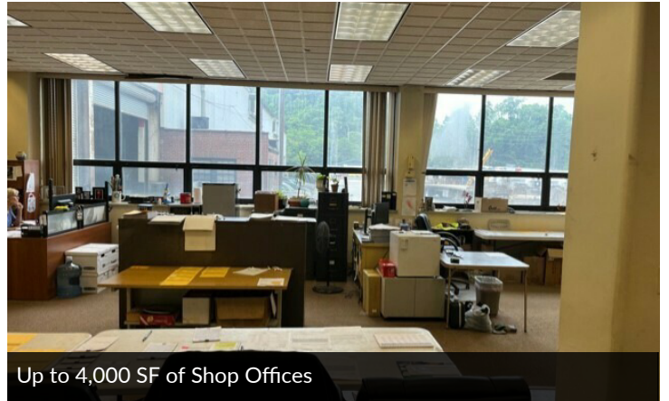
Up to 4,000 SF of Shop Offices