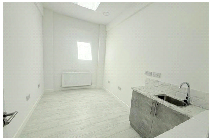
HAMPTON HOUSE, A GREAT HAMPTON STREET, BIRMINGHAM £550 PCM