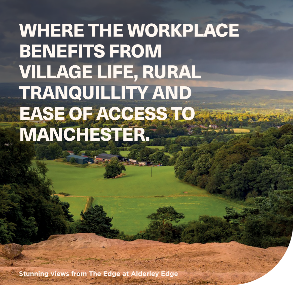
Stunning views from The Edge at Alderley Edge