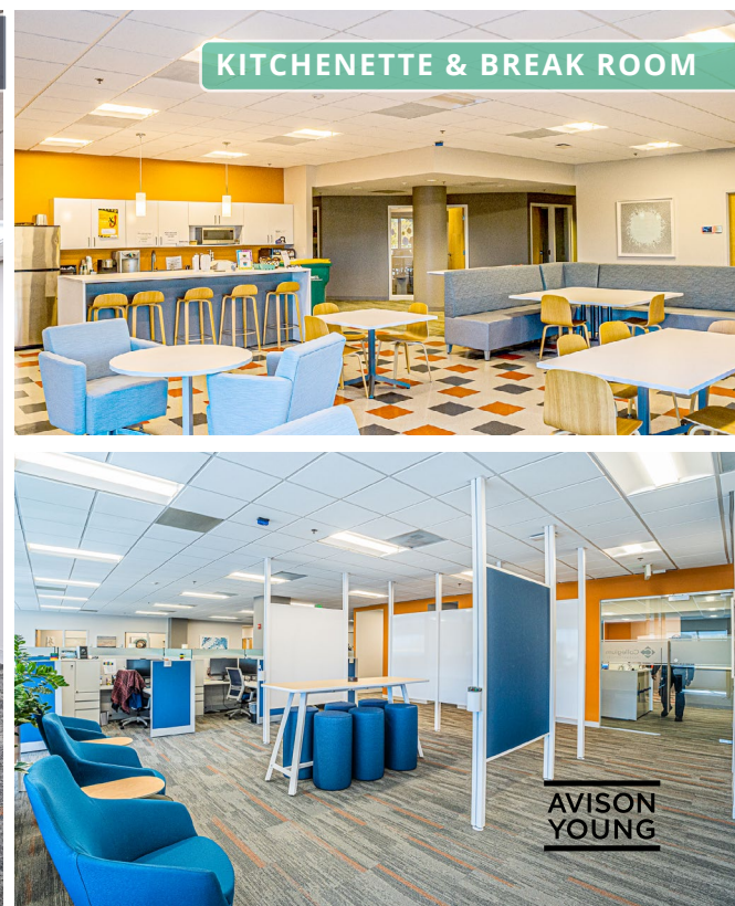
KITCHENETTE & BREAK ROOM