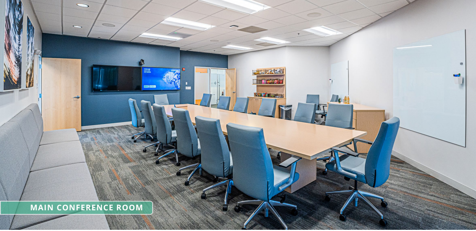
MAIN CONFERENCE ROOM