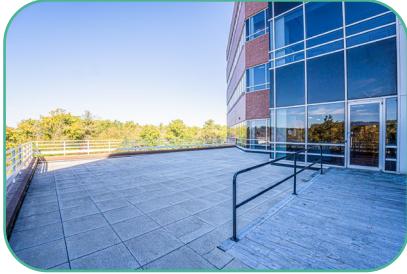
PRIVATE ROOF DECK