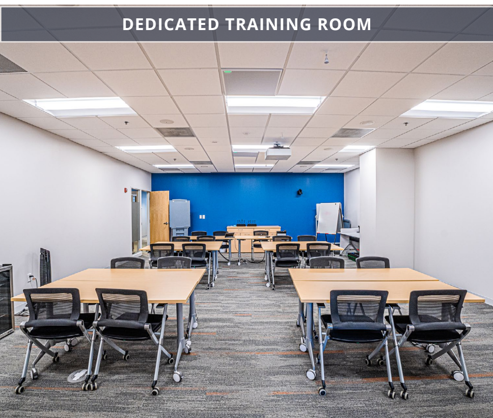
DEDICATED TRAINING ROOM