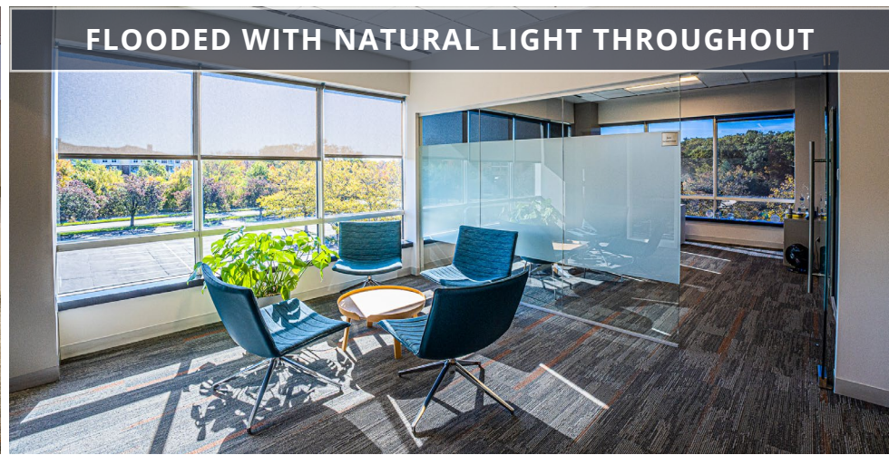
FLOODED WITH NATURAL LIGHT THROUGHOUT