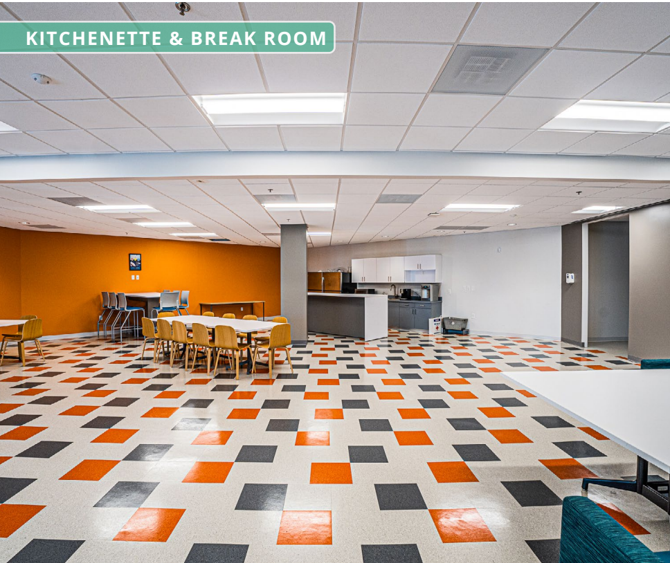
KITCHENETTE & BREAK ROOM