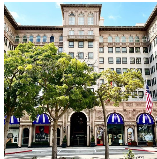
📍 BEVERLY WILSHIRE HOTEL