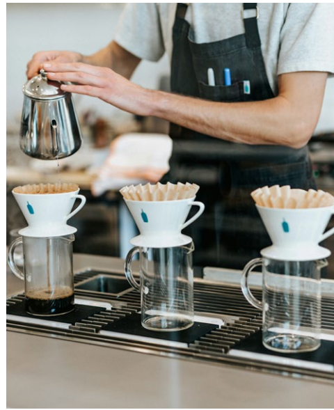
📍 BLUE BOTTLE COFFEE