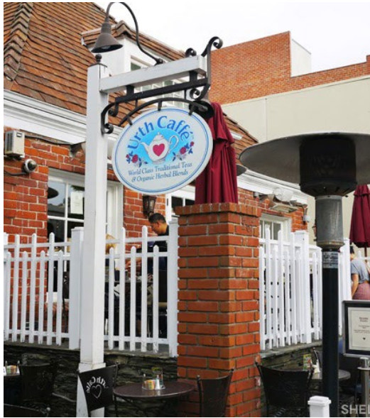
📍 URTH CAFFE