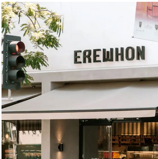
📍 EREWHON MARKET