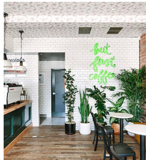
📍 ALFRED COFFEE