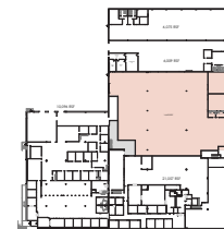
KEY PLAN - NTS