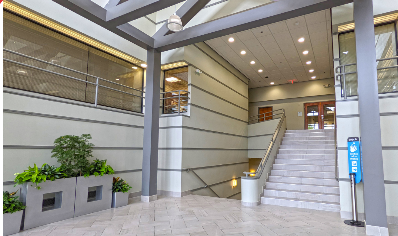
Beautiful atrium-style lobby with digital directory & seating