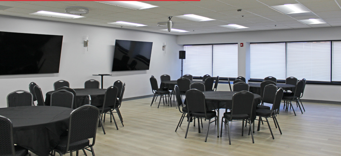
Brand new event space with seating areas & kitchen available for tenants